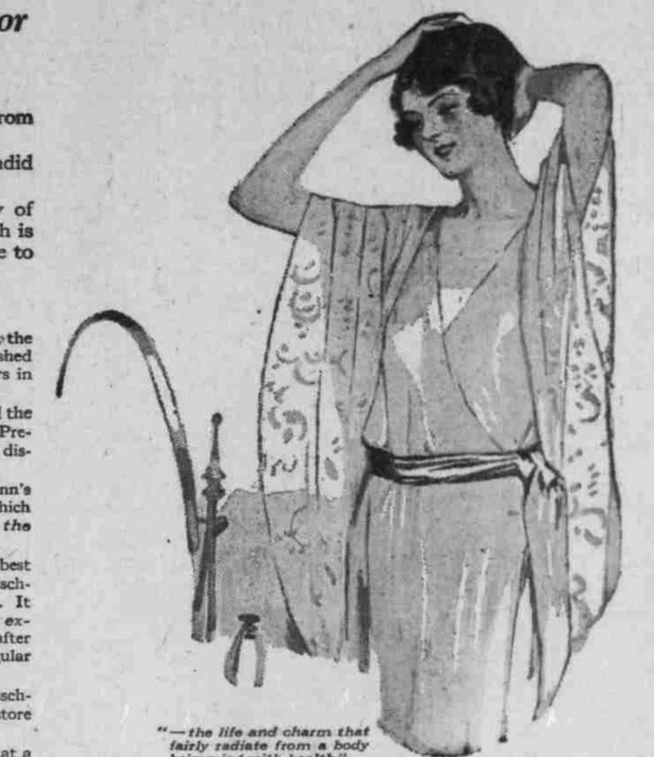
"—the life and charm that fairly radiate from a body brimming with health"

LISTINGS WANTED We have a large clientele of home-seekers from Northwestern States and Canadian Northwest. Homes $2500 to $4000. Modern. New firm. Up-to-date methods. Nothing too large, nothing too small for us to handle. H. Tupling Company, Inc. Telephone Broadway 0183 350 Pittcock Block