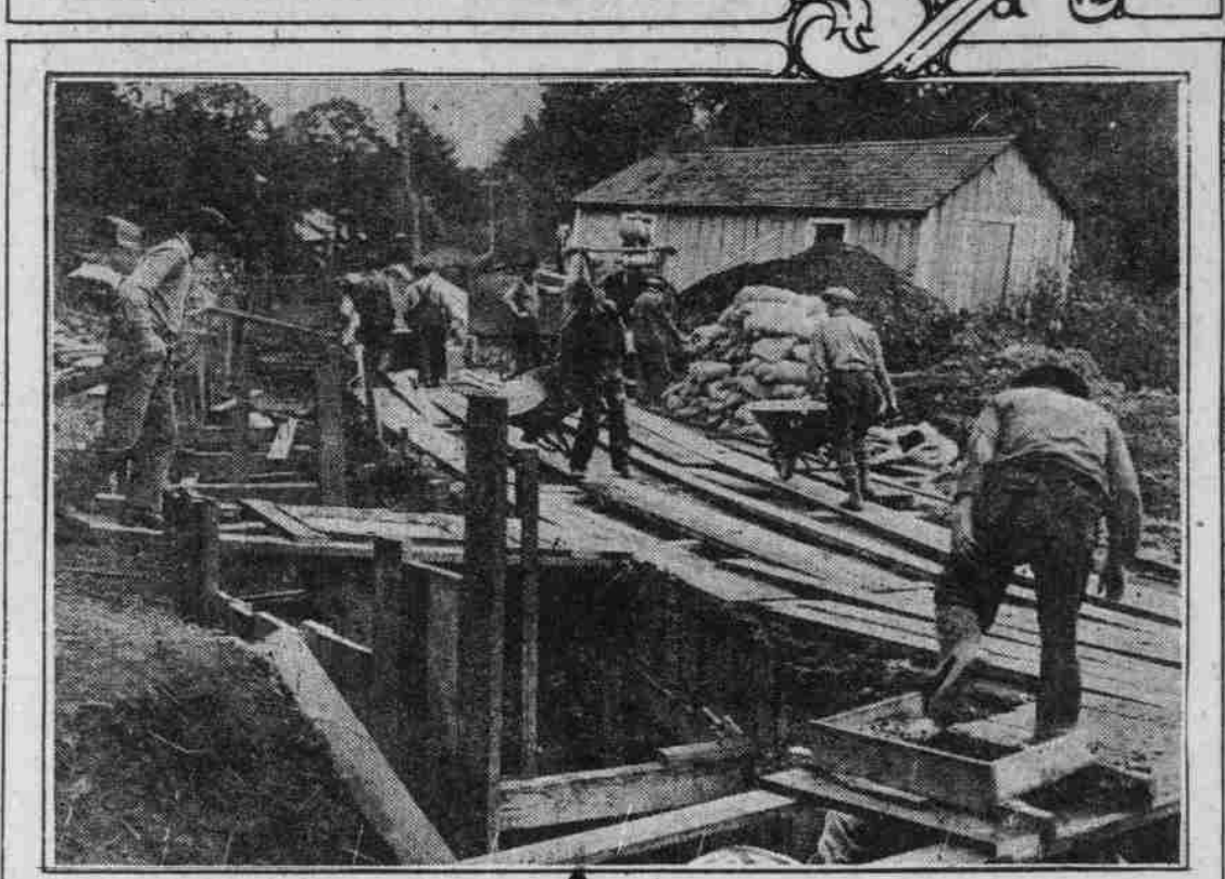
First pictures taken of construction of Lenis trunk sewer. Upper shows cofferdam at outfall of sewer at foot of Harney street. Lower is view of sewer under construction.