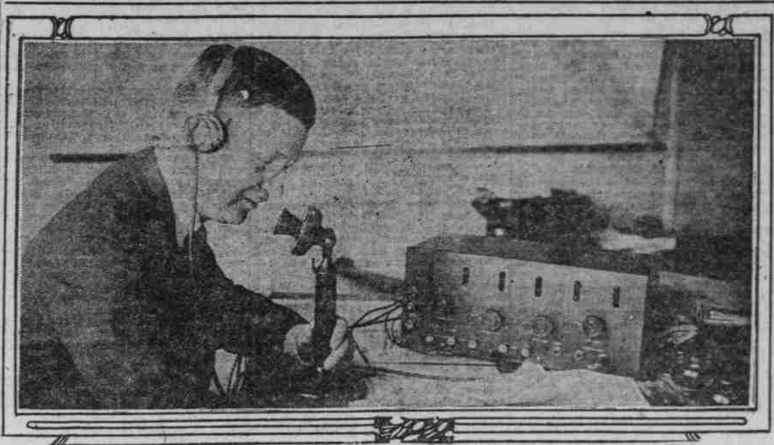
Brondcating information for use in the industrial world is now a regular service of the department of commerce. Official in department of commerce giving out information from South America for motor camanufacturers.

Service Which Defies Weather Conditions Being Adopted by Large Concerns and Extensions in All Parts of Country in Near Future Are Predicted.