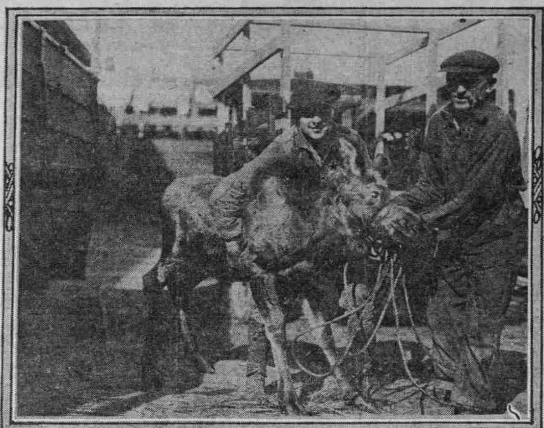
THIS LITTLE ALIEN WAS FULL OF FIGHT.