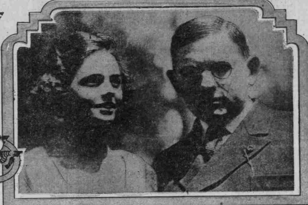
Author And His Inspiration For Novel