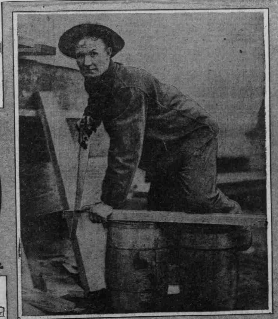
Woodfill Wars Greatest Hero Works To Meet Payments On Home