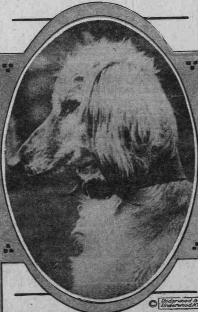
Rare Afghan Hound