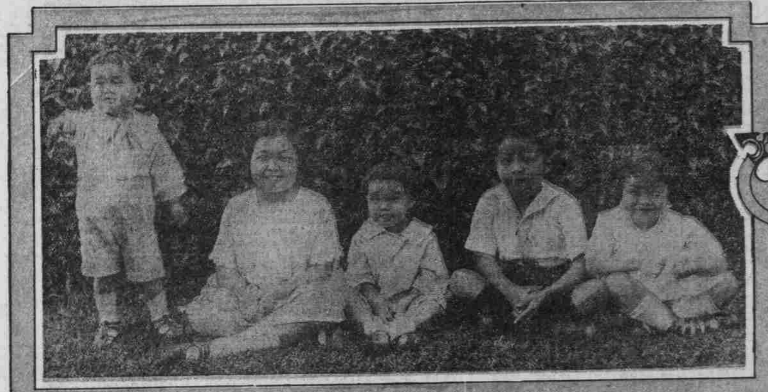
Declared Most Beautiful Chinese Children In Capitol