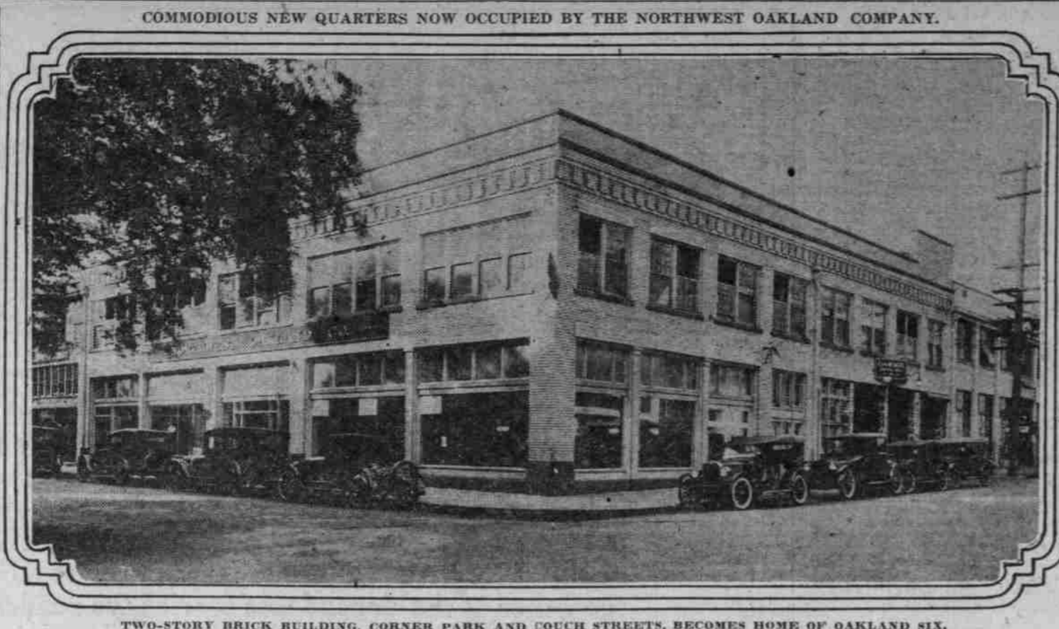
TWO-STORY BRICK BUILDING, CORNER PARK AND COUCH STREETS, BECOMES HOME OF OAKLAND SIX.

Lakeview-Burns Highway. Lakeview-Burns—Best route is via Blalock Canyon, Clem and Condon. Leave Columbia river highway at Blalock. Dirt road in good condition to point 6 1/2 miles north of Condon; balance of distance good macadam.