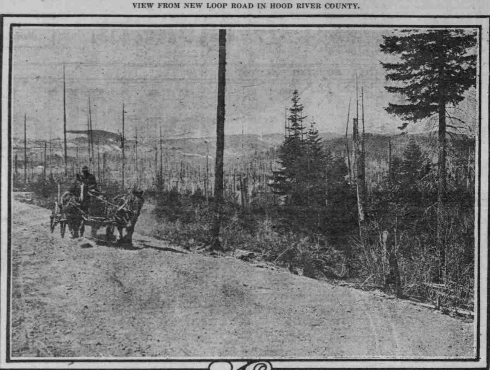
Despite difficulties attending construction of the Mount Hood Loop road, in Clackamas county, work on the road is going ahead rapidly in Hood River county, as the above view of a section of the new road will show. The photograph shows a portion of the new grade within the national forest boundaries. This section will eventually reach from the vicinity of Mount Hood lodge on the north side of the mountain clear around the east and south sides of the peak to Government Camp, connecting with the present road at that point.