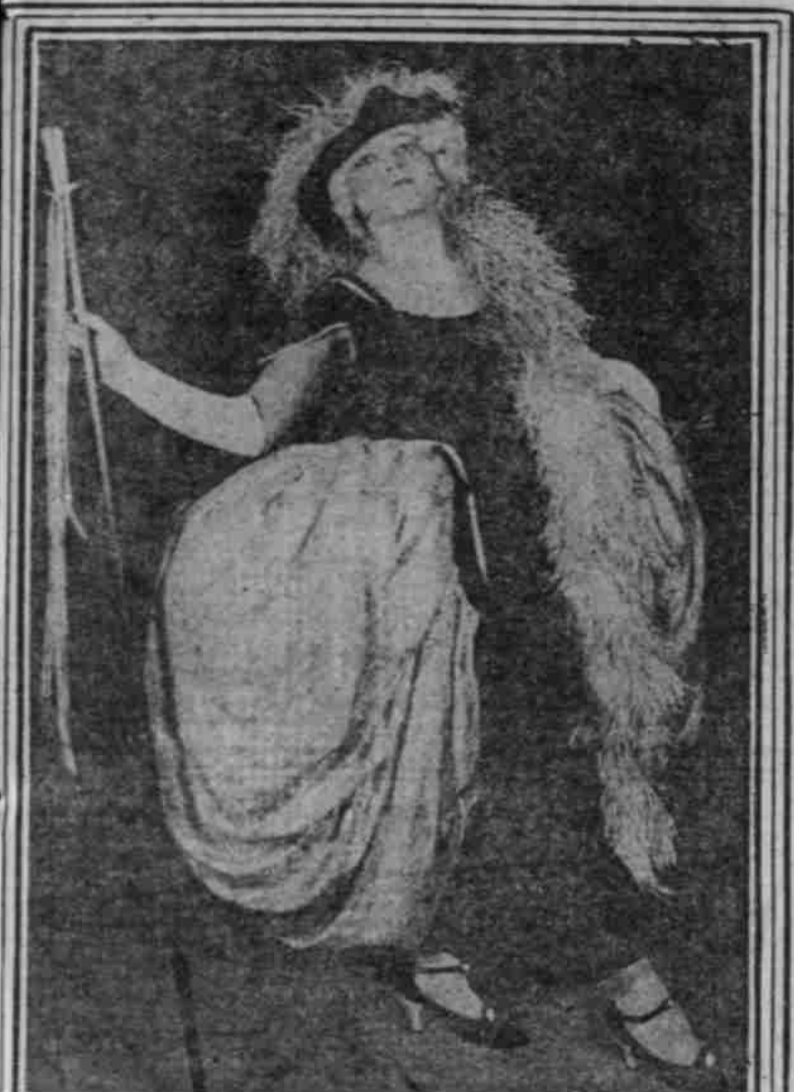
One of the Dixie Vamps in The Pinwheel Revue.