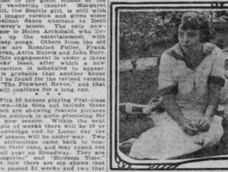
Wallace Reid, Paramount star, and his wife, formerly Dorothy Davenport, on the grounds of their home at Beverly Hills, Cal.

WALLACE REID, Paramount film star, holds the indoor and outdoor championship in bobbing. He has more hobbies in the square foot than any other screen actor now before the public.