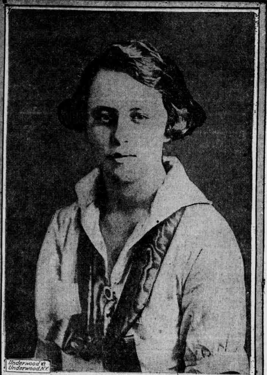
Swimmer Victim Of Sea Tiger

Secretary of War Weeks recently reviewed the cadets of Virginia Military institute at Lexington, Va., and expressed satisfaction at the increasing number of military schools throughout the country.