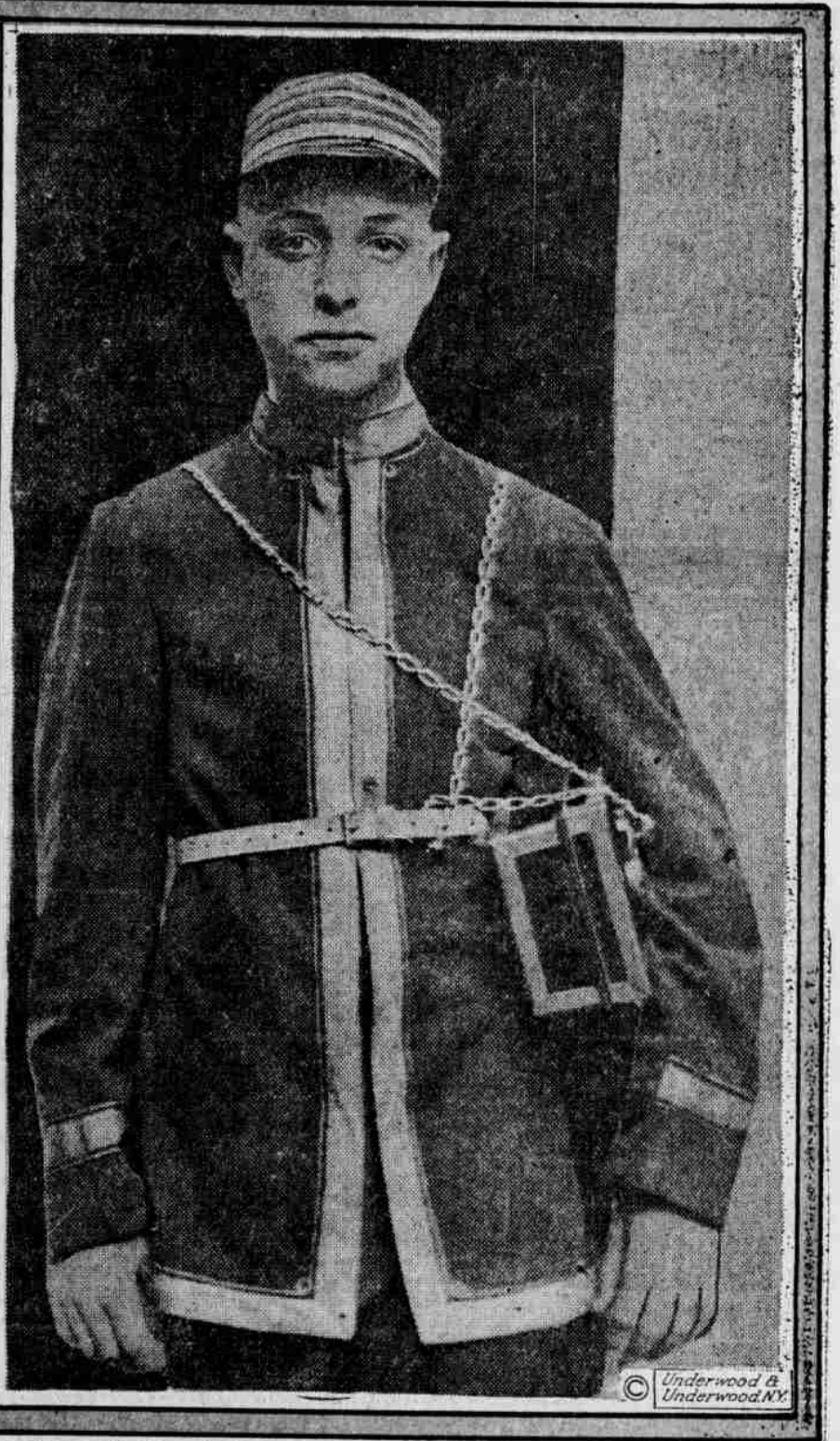
Novel "Safety" Messenger Service In Wall Street