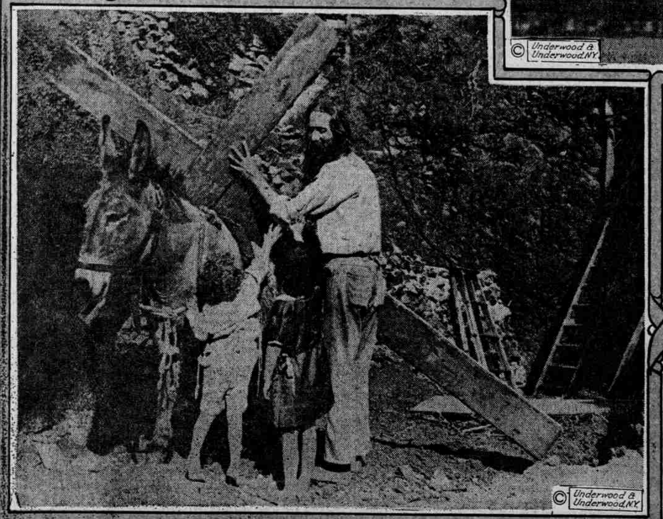
Pilgrimage Play Life Of Christ, Has Become American Oberammergau