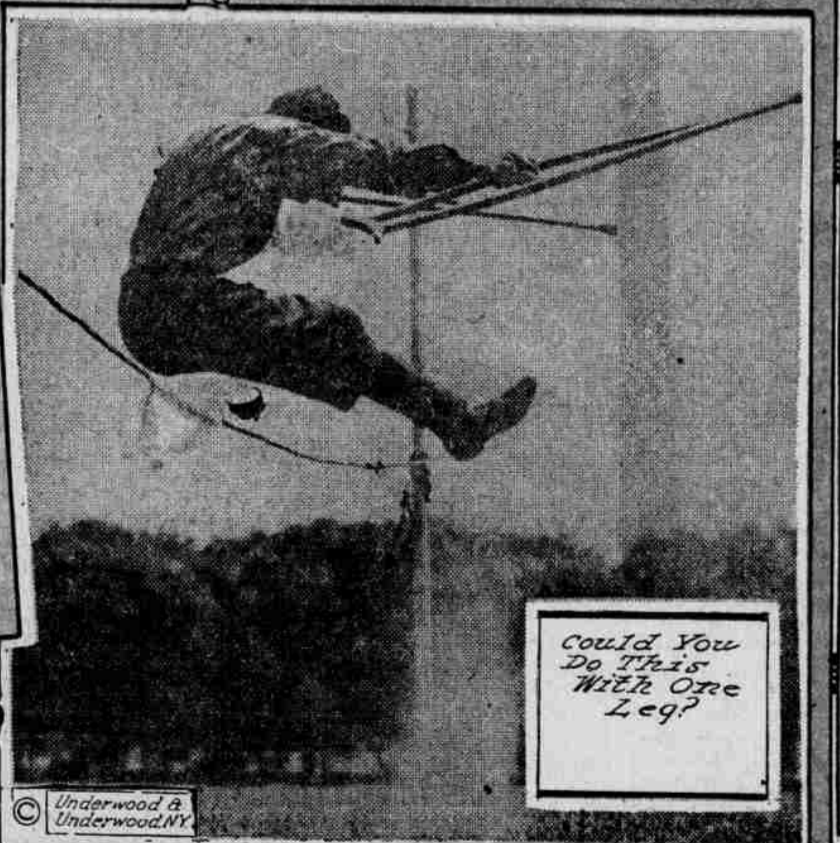
Could You Do This With One Leg?