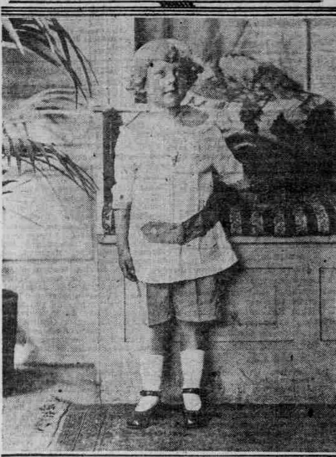
A Cunning Tunic Suit For The Wee Laddie.

Little Suit Is Made of Linen; Short, Wide Breeches Are of Yellow and Loose, Cool Tunic Is of Handkerchief Linen.