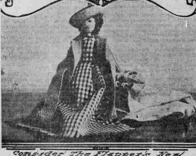
Consider The Flapper's New Sport Handbag

There is constant variety in fashions for the small boy, and mothers do not have to rely on the same old styles in sailor suits and Oliver Twist suits, as they did a few seasons ago. This new tunic costume for a little chap of four years old is boyish and yet pretty.