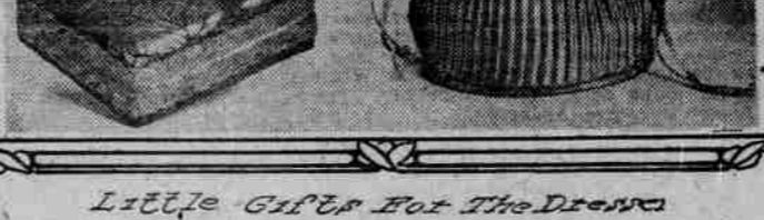
Little Gifts For The Dresser

It is not the fashion now to have toilet articles in plain view on the dresser. Manicure sets, powder puffs and the like are hidden in ornamental receptacles. Perfumes are kept in ground glass bottles that do not "show through," and jars of cream hide in the bathroom cupboard. Novelists who write of "her luxurious toilet table, with its array of flasks, jars and bottles, containing beautifiers," are all out of style. The "making of beauty" are now kept out of sight. For the modern dresser are the dainty bag and box pictured—pretty trifles offered in the shops as gifts and sure to be accepted by any woman. For these silk and lace bureau fixings soon become shabby or faded and are to be replaced. The powder puff bag is of Du Barry rose satin.