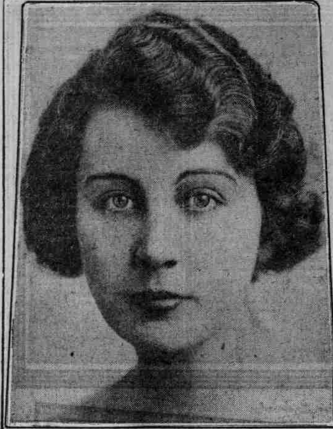
DOROTHY DALTON, ONE OF FILMDOM'S BIGGEST ASSETS, WHO WILL WEAR RAIMENT MORE STRICTLY FEMINE IN LATEST PRODUCTION.

In Past Three Pictures Paramount Star Frolicked Around in Trousers, but This Feature Calls for Elaborate Gowns.