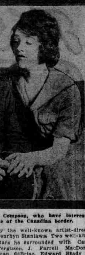
Popular stars, Tom Moore and Betty Compton, who have interesting vehicle in Gilbert Parker's tale of the Canadian border.

Tom Moore and Betty Compton Co-Starred in Picturesque Story Entitled "Over the Border," Containing Thrills Galore.