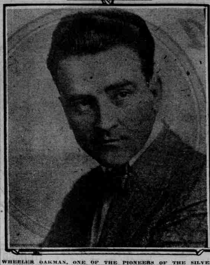
WHEELER OAKMAN, ONE OF THE PIONEERS OF THE SILVER SCREEN, GIVES HIS VIEWS REGARDING WORKING BEFORE LENS INSTEAD OF EYES.

Star Disapproves Theory that Camera Work Lacks Inspiration and 'Bouancy Because Actors Can't Realize "Feel of the Spectators."