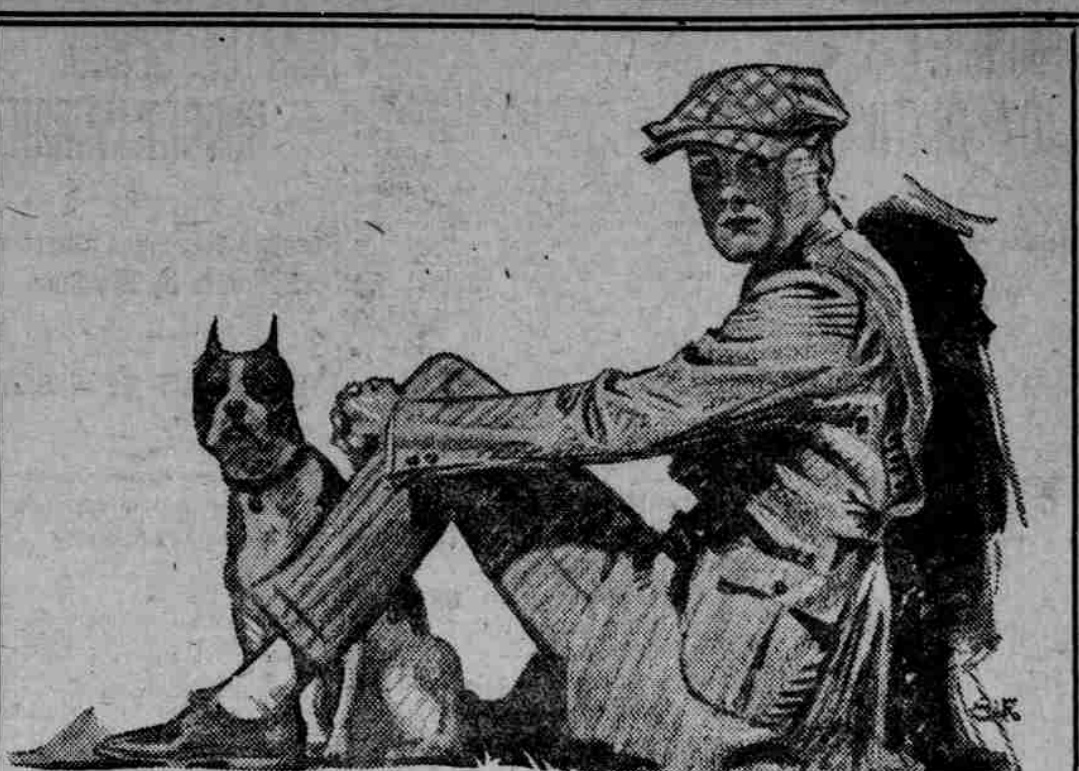
Copyright 1922 Hart Schaffner & Marx

CENTRALIA, Wash., June 3.—(Special.)—A special election will be held in Winlock on June 10 to authorize