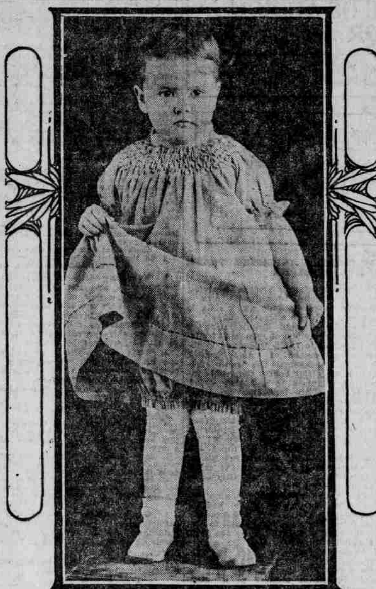
Trook of Pale Green Litten.

Latest Accessory to Extremely Juvenile Attire Is Made to Match Material Clothes Are Made From.