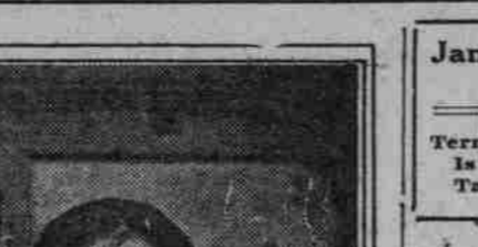
James John welcomes its freshmen.