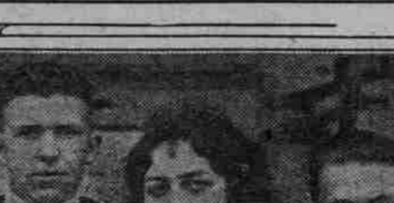
James John welcomes its freshmen.