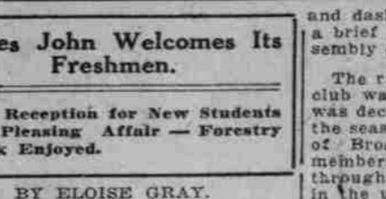
James John welcomes its freshmen.