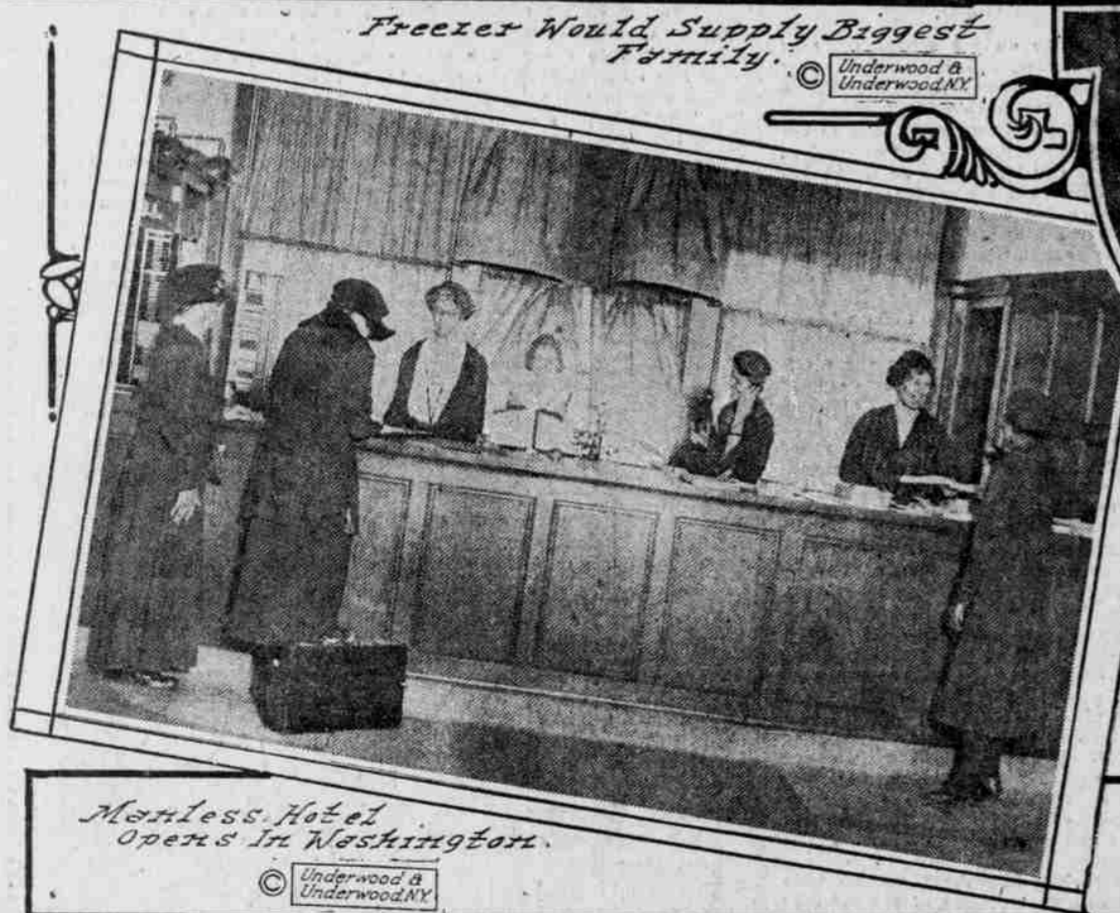
Homeless Hotel Opens In Washington.