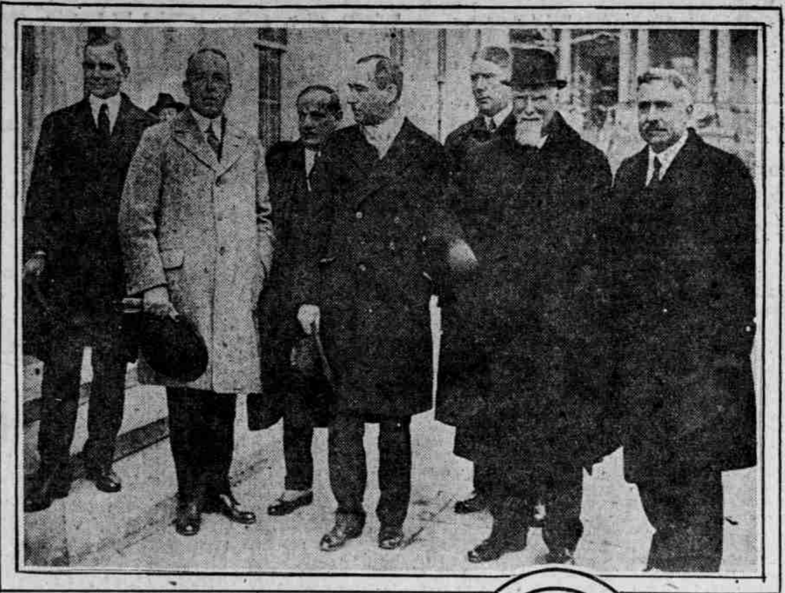
Coast Shipping Men Meet President.

King Alexander of Serbia and his fiancée, Princess Marie of Rumania, were recently photographed together as a pair of royal sweethearts.