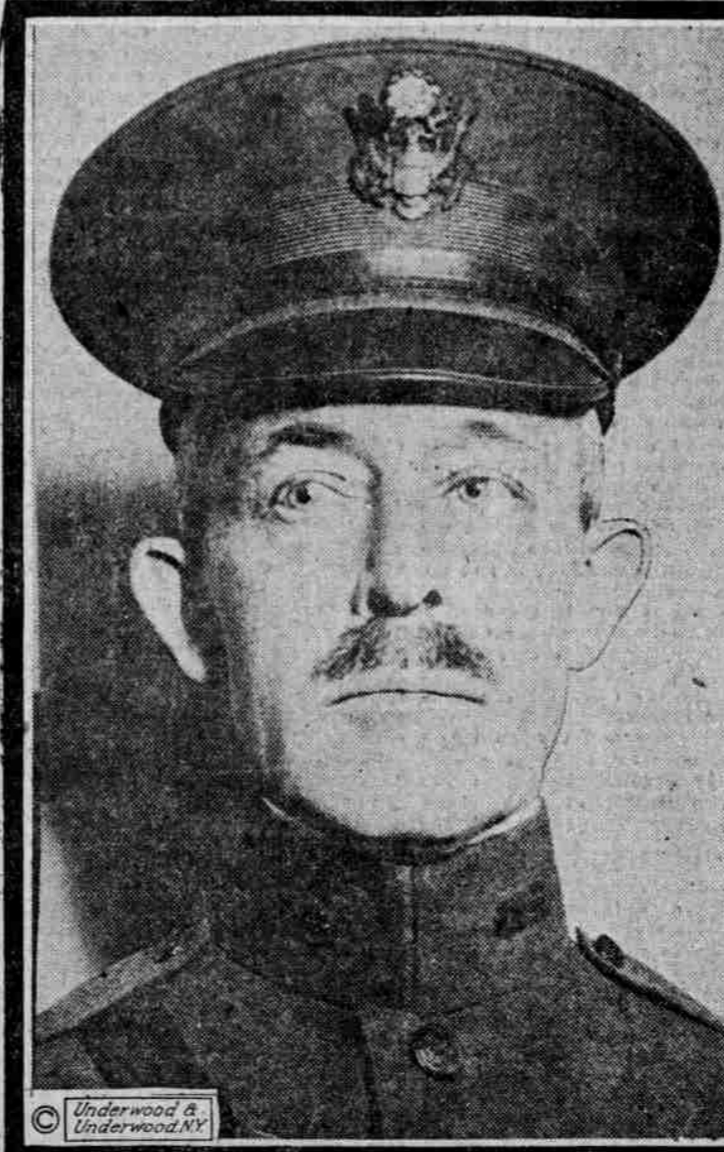
Former Vancouver Commandant Honored.