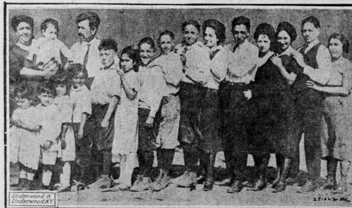
Sixteen Children In San Francisco's Largest Family.