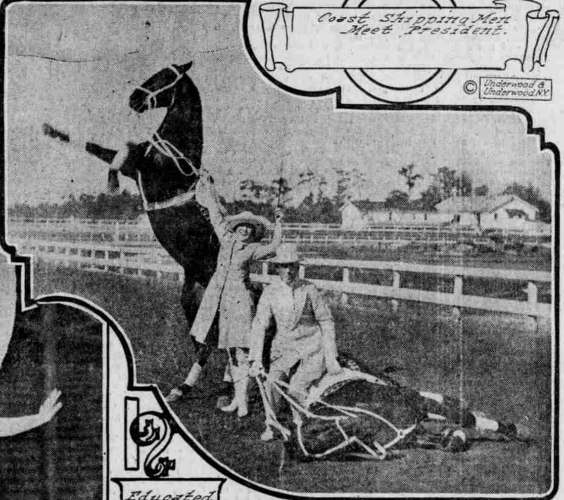
Educated Horses Taken South In Winter.