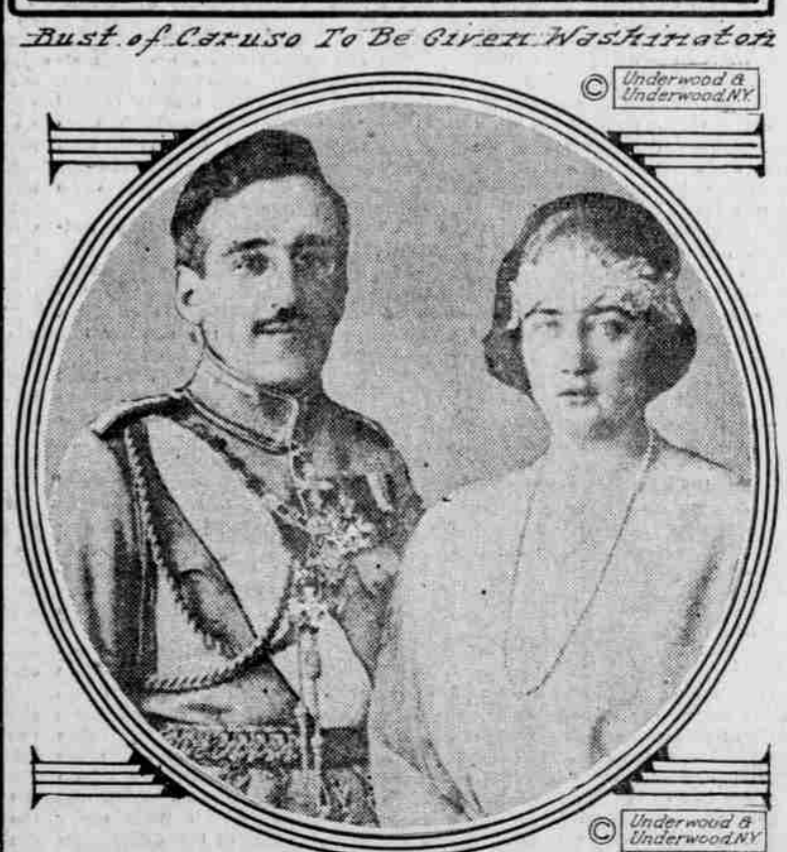
Royal Sweethearts Pose Together.