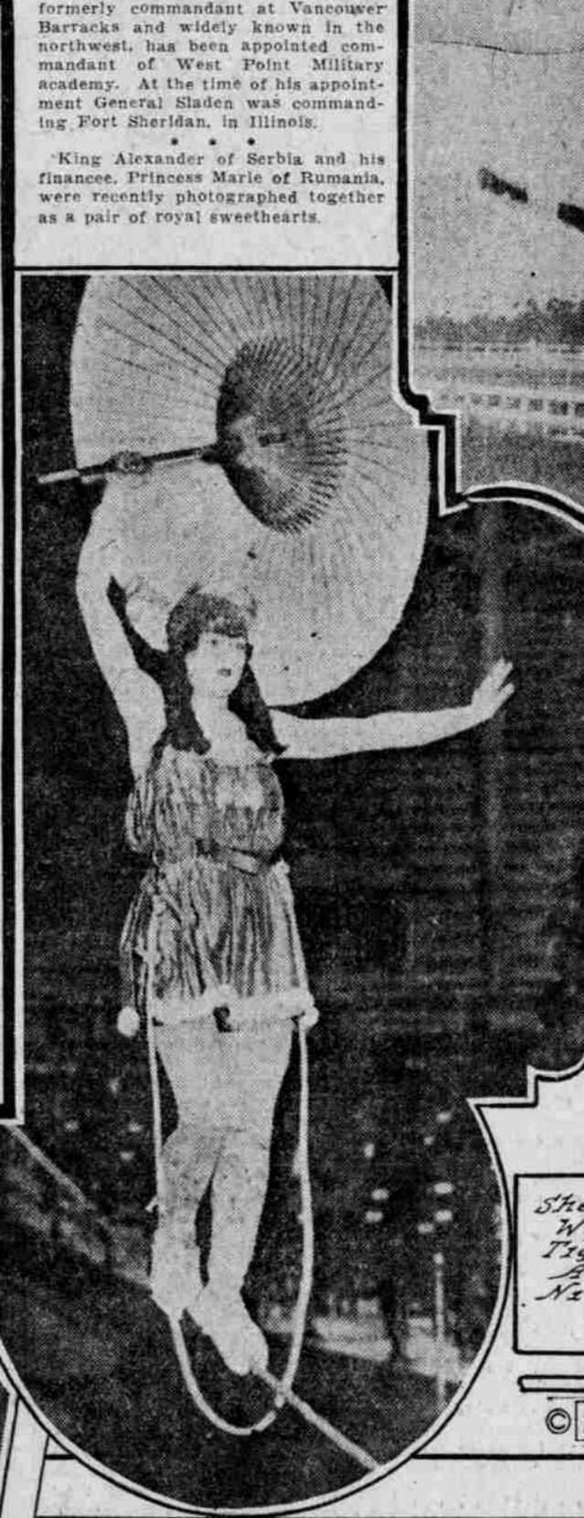
She May Walk Tight Rope Across Niagara.