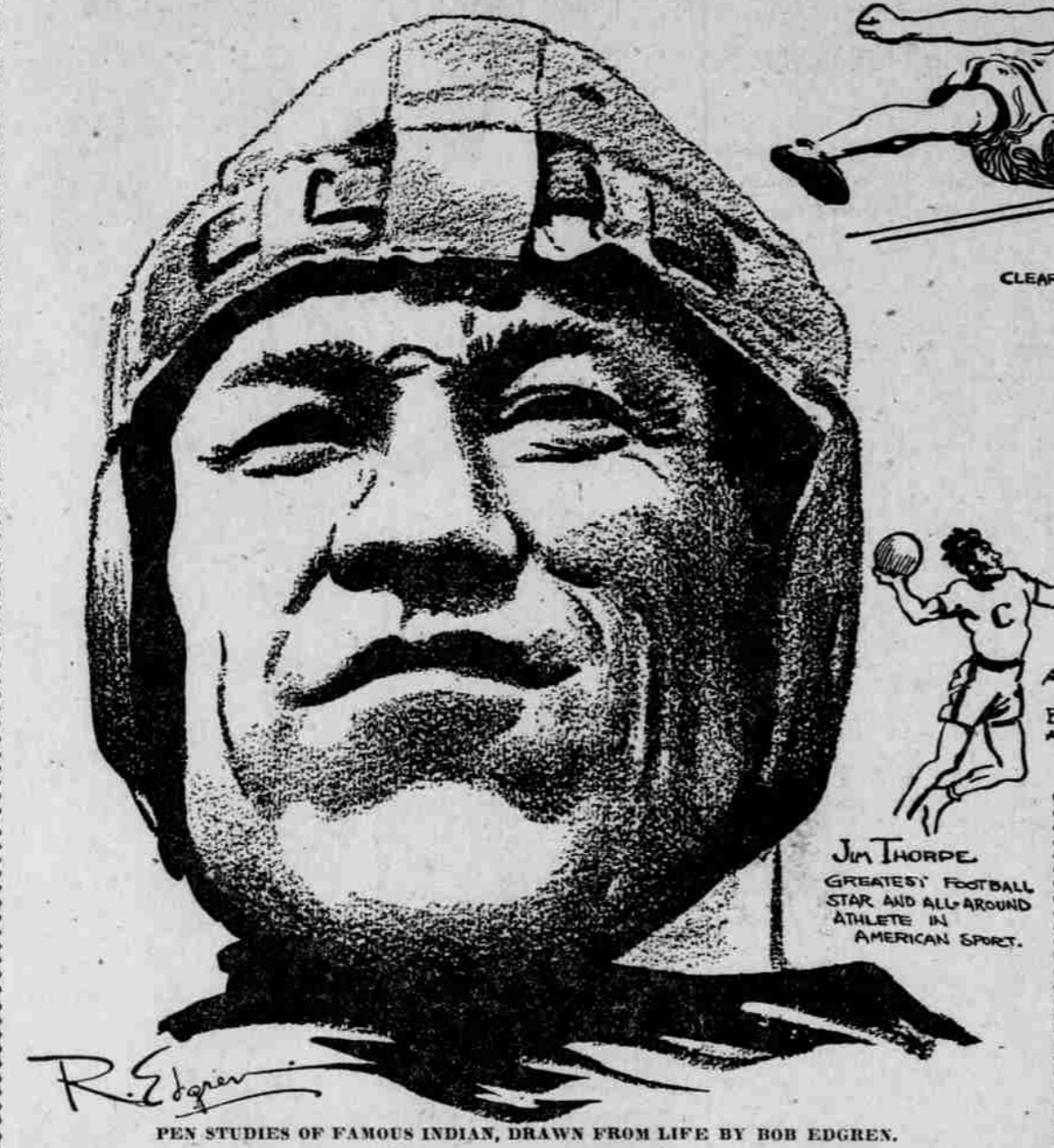
STUDIES OF FAMOUS INDIAN, DRAWN FROM LIFE BY BOB EDGREN.