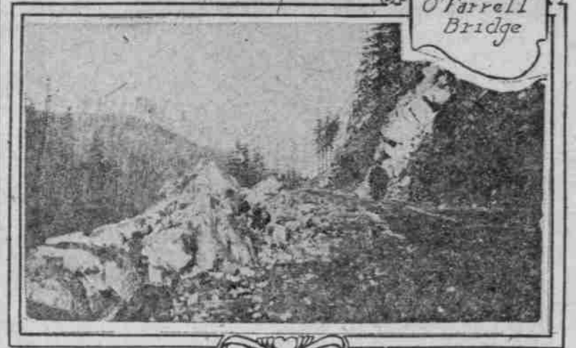
Section of Road Near Melmont.