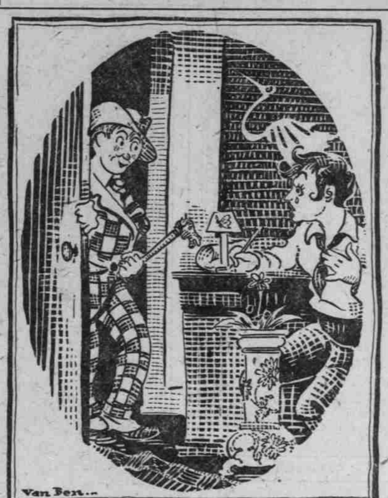
ARTIST AND PURE WHITE SOUL.

ONE day a pure white soul that made Sonnets by hand was hiding in its apartment and embroidering a Canto.