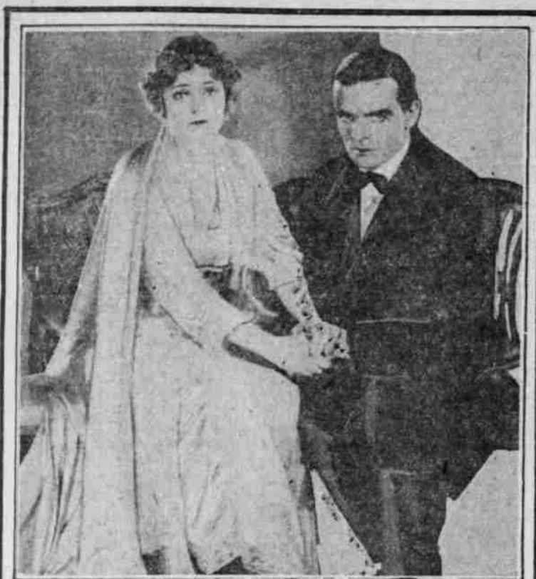
Marjorie Rambeau and Frank Conroy in "Daddy Goes A-Hunting"

Theater Audiences So Particular That Real Money-Makers on Broadway Can Be Counted on One Hand.