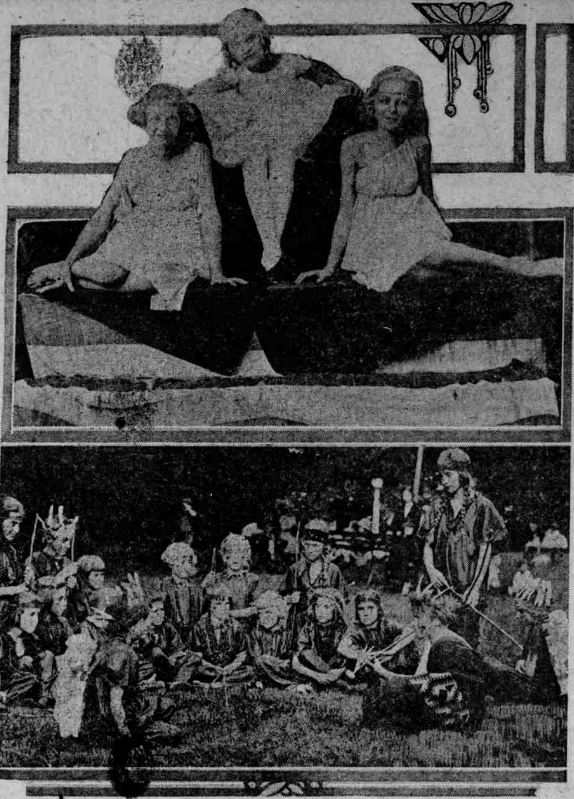
Upper—Queen Sellwood and her court to preside at Labor-day exercises, marking the close of season at Sellwood park. Lower—Indian council of Sellwood park, prepared to enact famous Indian dances.

Boys and girls who have participated in the activities of Sellwood and Kenilworth parks during the summer season will celebrate the close of the summer classes with a spectacular programme to be held at Sellwood park this afternoon.