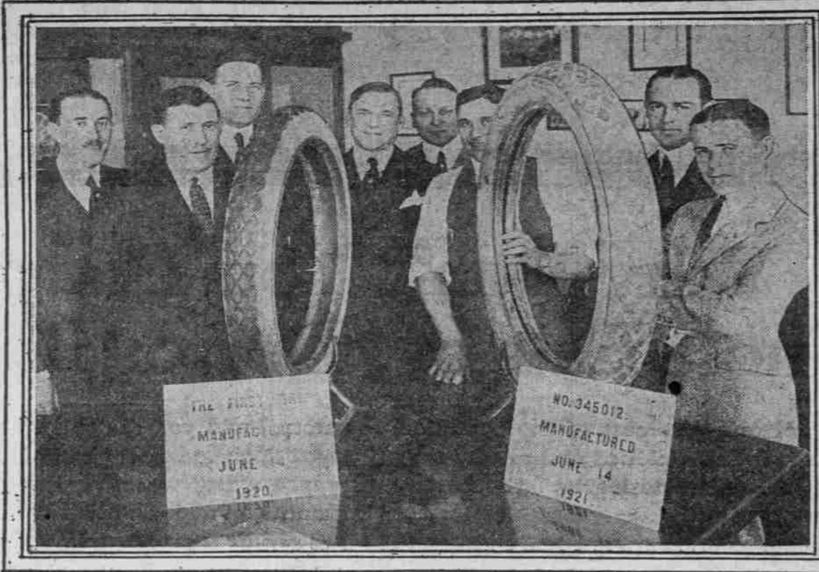
FIRST PACIFIC COAST GOODYEAR TIRE AND ITS COUNTERPART ONE YEAR LATER.