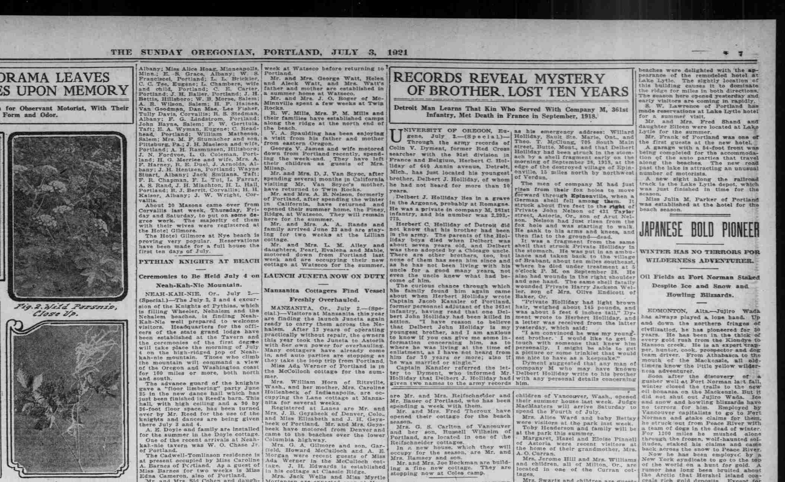
Fig. 2. Wild Parsnip,