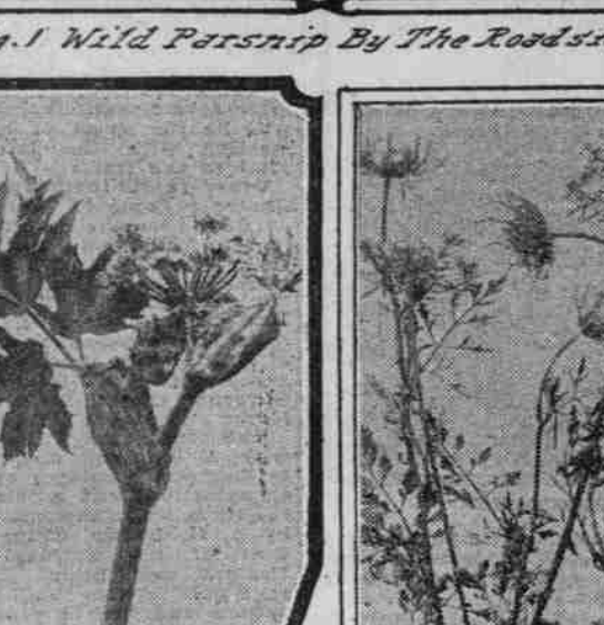
Tig 3 Wild Parsnip, Leaves And Flowers