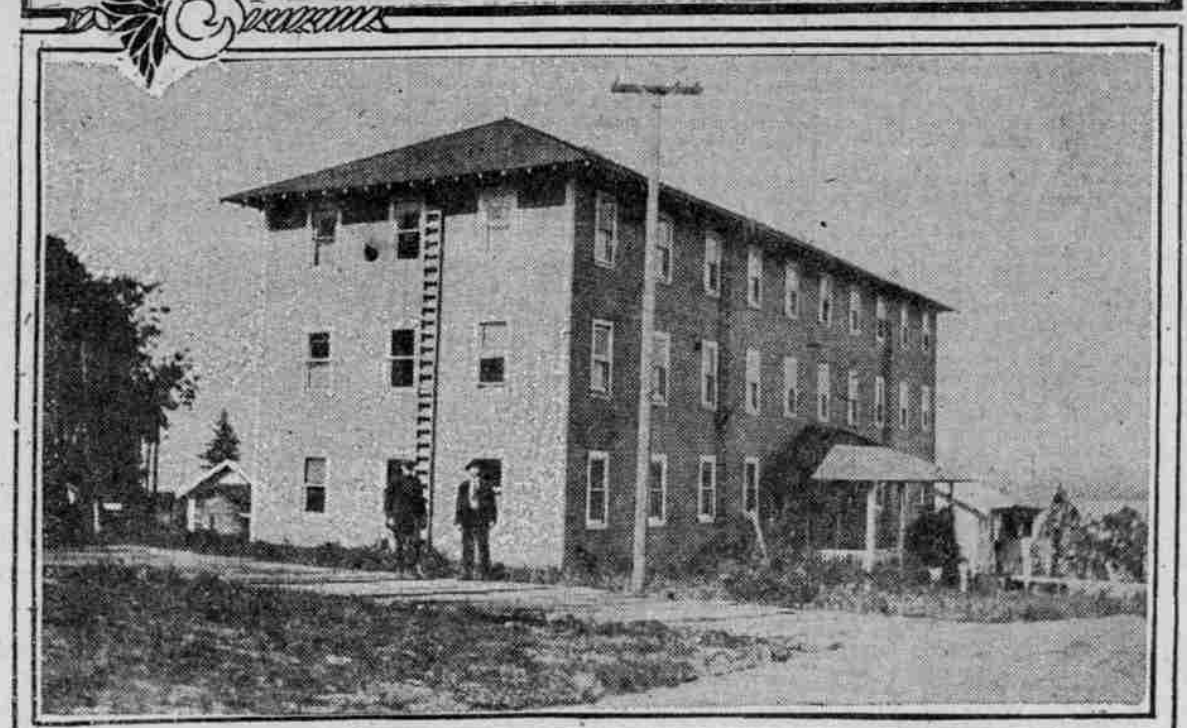
of the buildings acquired by Oregon Baptists for summer assembly and other church activities at Columbia City, Or. Above—Office building to be used for administration purposes. Below—Hotel which will house girls and married people at the assembly.