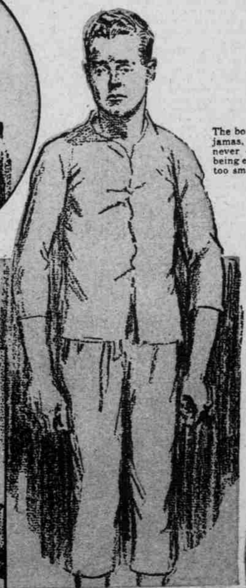
The borrowed pajamas, which never quite fit—being either much too small—