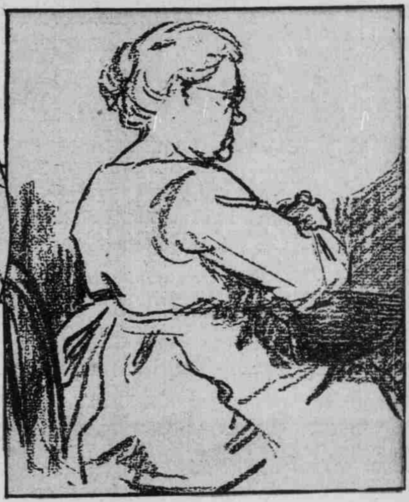
After the coffee grinder has done its bit, just beneath the guest room, the chopping bowl is brought into play.