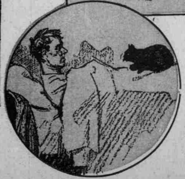
The over-night visitor who hates cats and the family pet never fail to discover each other before morning.