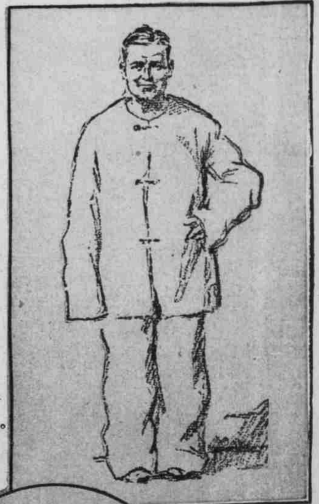
Or much too roomy