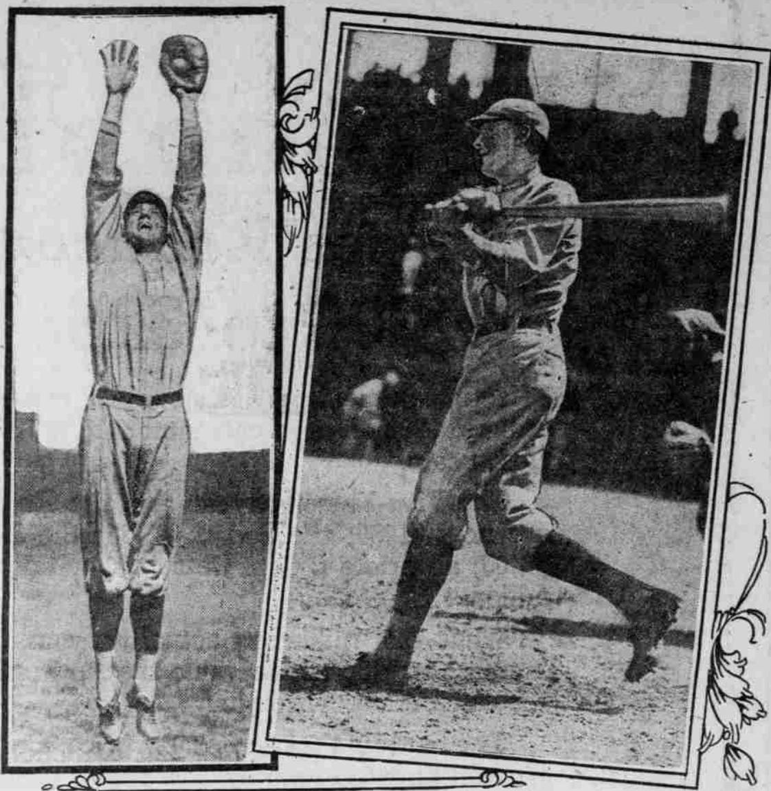
GEORGE KELLY OF THE NEW YORK GIANTS.