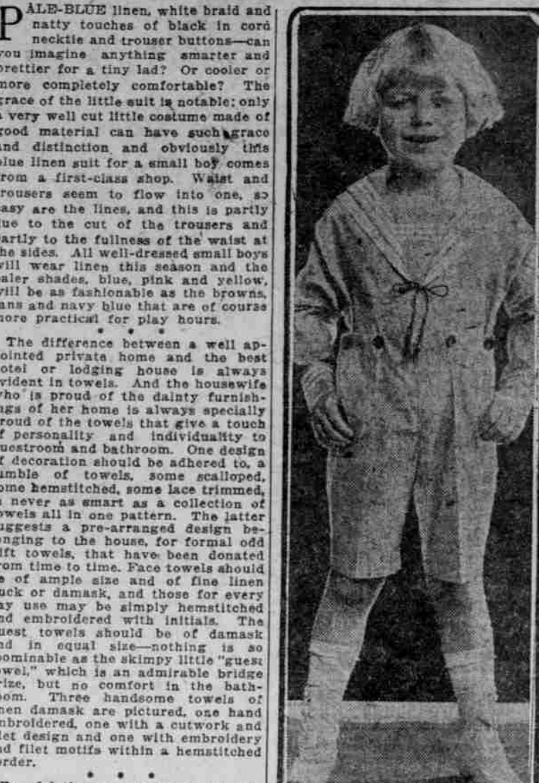
Blue Linen for Small Boy

Unless one knows just what type of garment one wants it is difficult to give width of skirt, however, if a frock has a tunic the skirt is still rather narrow. All tailored skirts are wider than last season, some extending to the waist and some to the knees. Some of these fabrics would appeal to you, tricotine, French serge, tweeds, shepherd's plaid and other small checks. There are also many new fabrics from which you could make a happy selection.