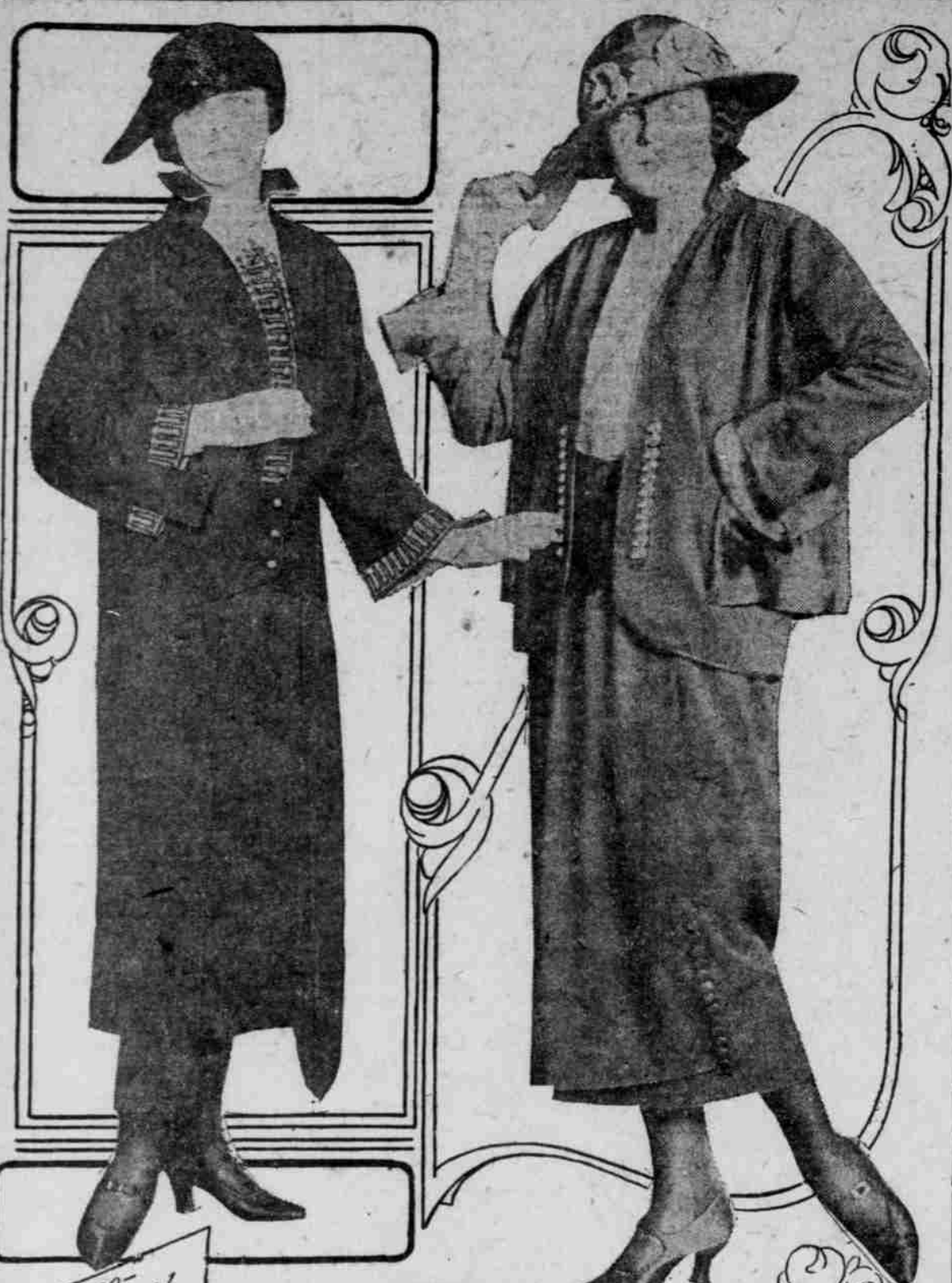
6570—New Paris Skirt from Drecoll

Irregular Skirt Length Puts in Appearance, While Navy-Blue Poplin Makes Up Stuningly—Green and Black Hats of Simple Models Prove to Be Dashing.