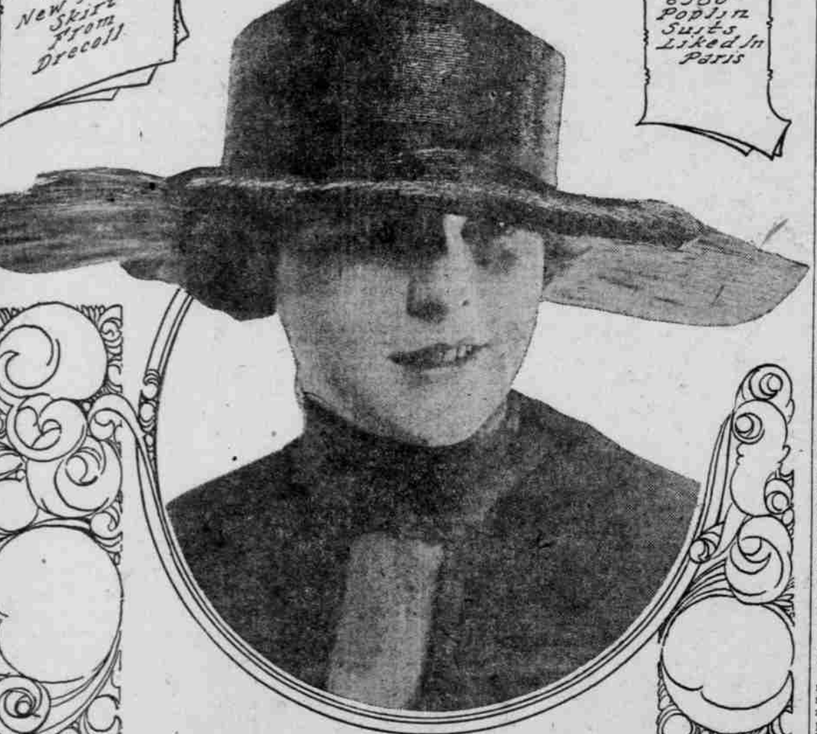
Dashing Are Green and Black Spring Hats.

THE irregular skirt length is here (6570) achieved by Drecoll, with four panels, which drop below the skirt hem and loop up underneath. Smaller panels in the sleeve repeat this idea. This Drecoll suit is of navy blue serge and has a delightful little jacket, straight in line at the back, but shaped in somewhat at the front under a fitted lower section, which acts as a belt. The vestee is of straw-colored linen embroidered in old red and black. These linen vests are very fashionable in Paris just now.