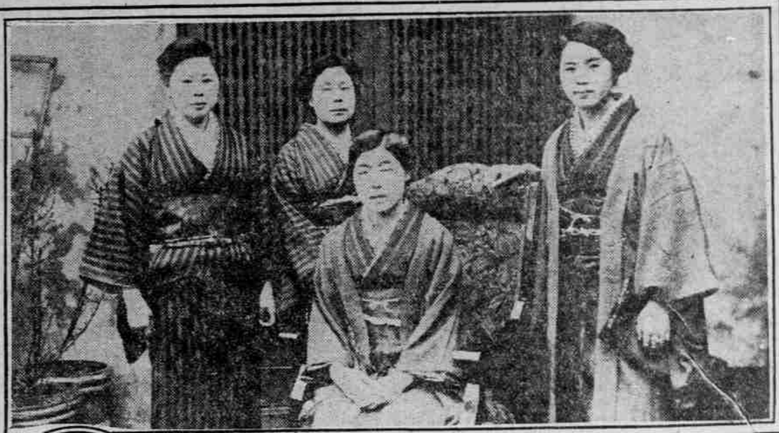
Champion Japanese Silk Reelers.