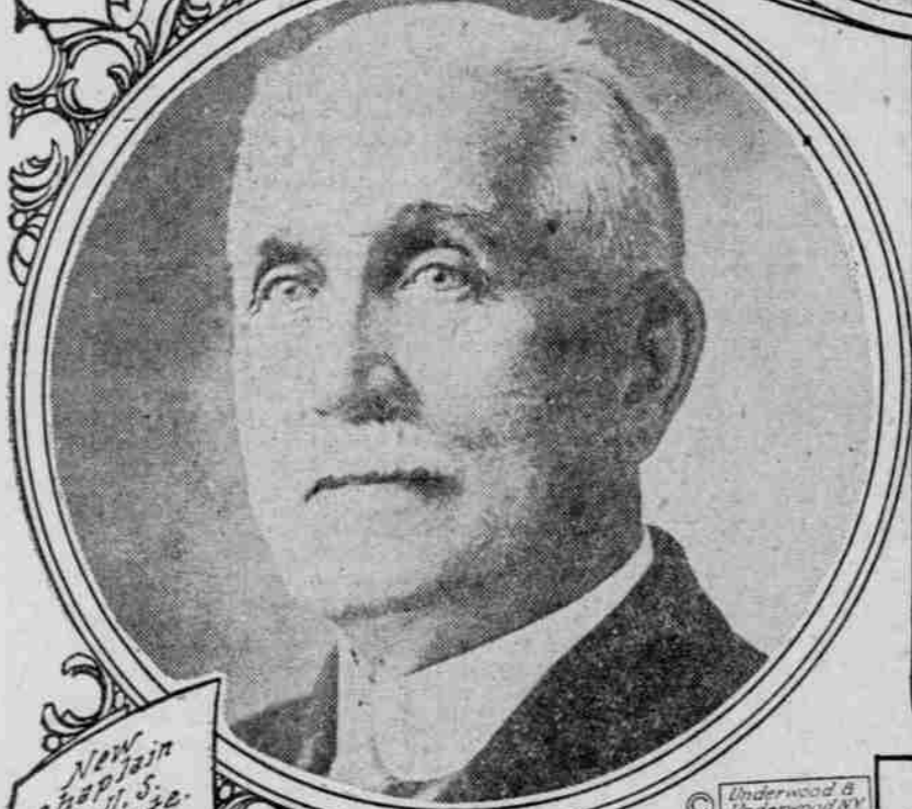
New Chaplain of U. S. Senate.