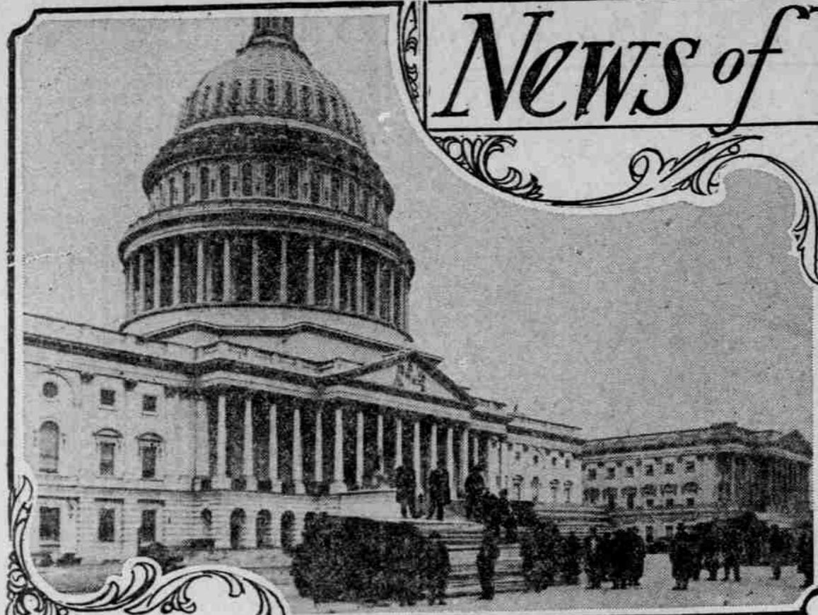
Inaugural Preparations Voted By Mr. Harding.