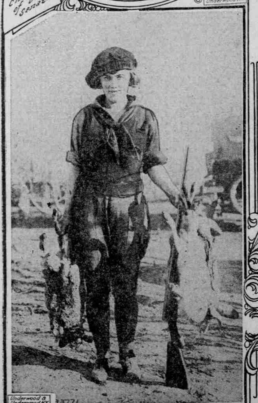
Washington Girl Star Nimrod.