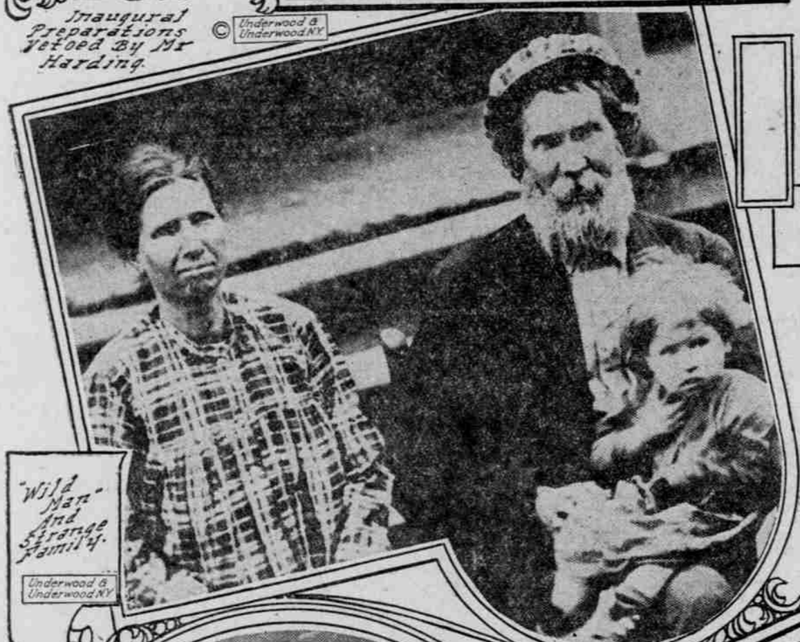
"Wild Man" and Strange Family.