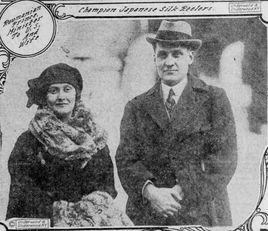
Roumanian Prince, Minister To U. S. and Wife