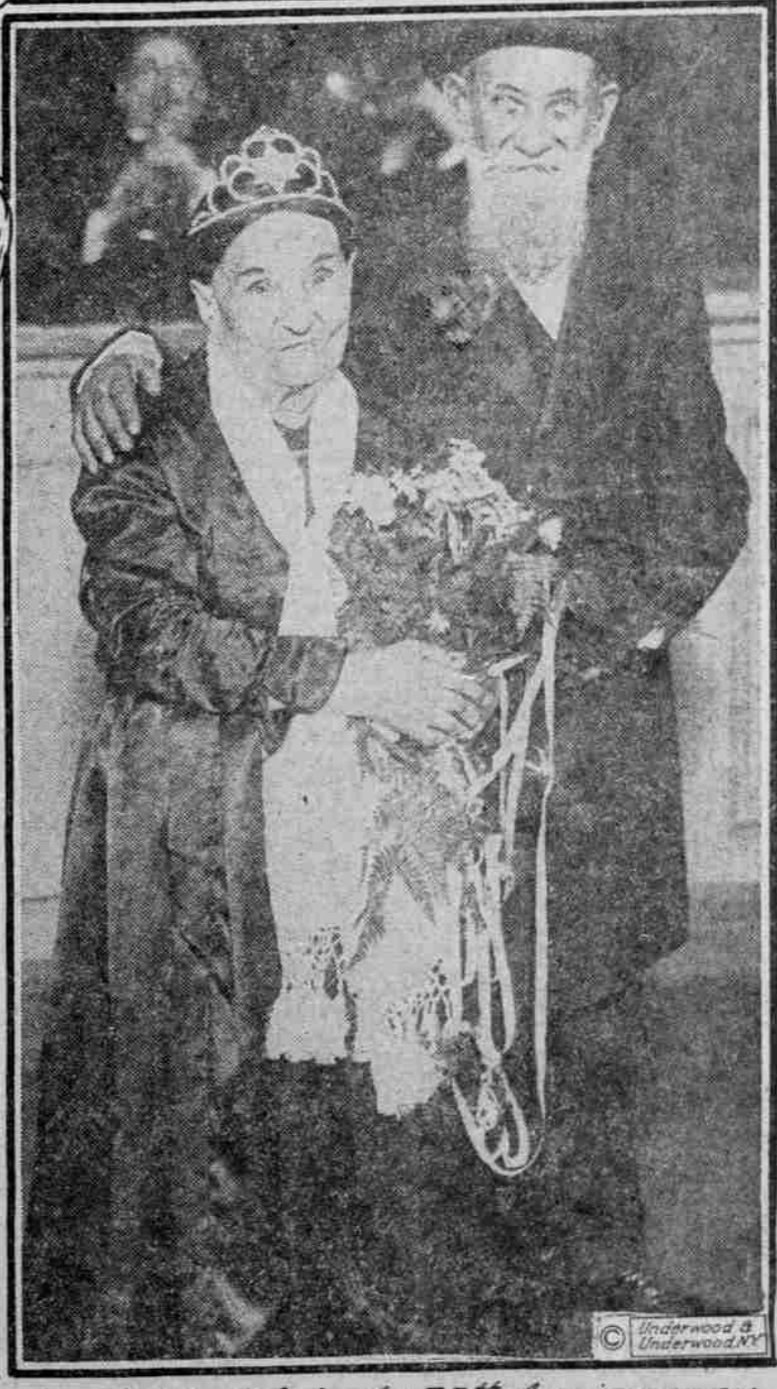
Couple 88, Celebrate 75th Anniversary.