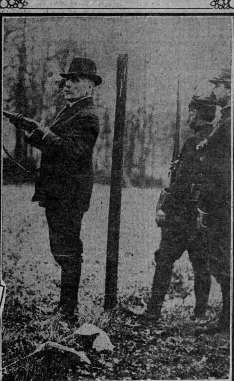
Marshal Foch Enjoys Hunting.