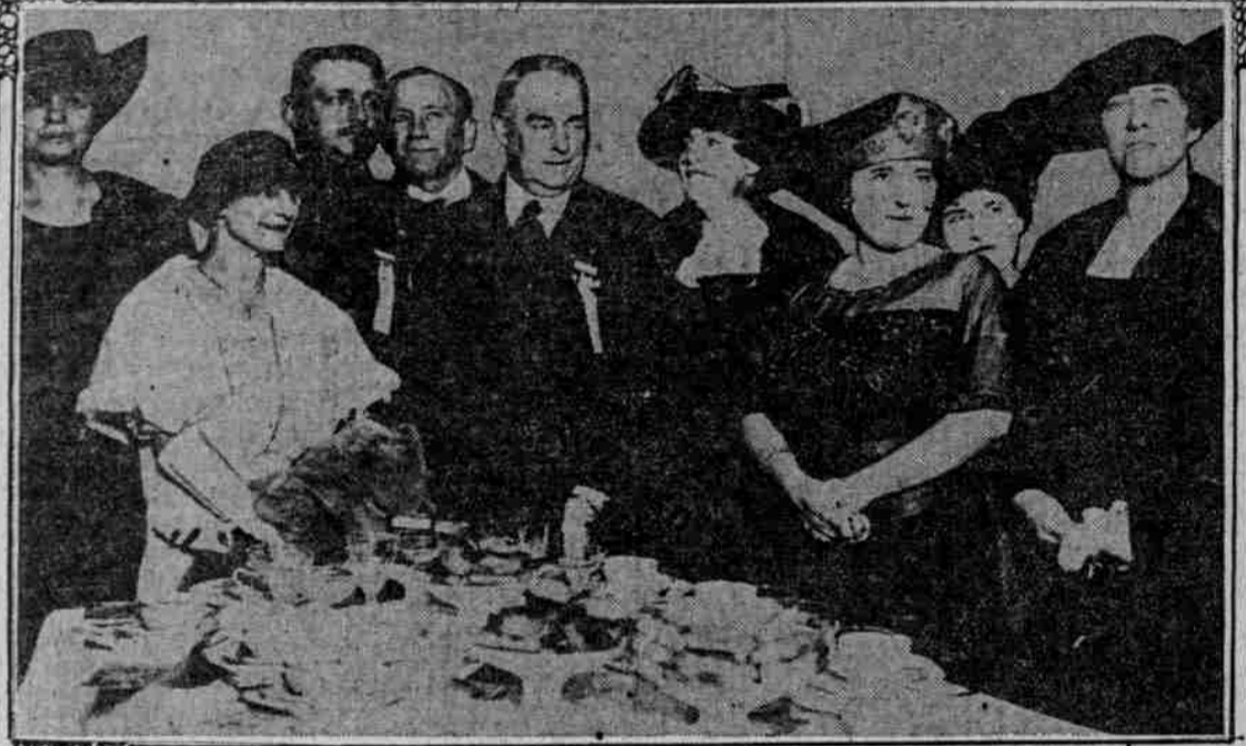
Mrs. Obregon Entertains Americans.