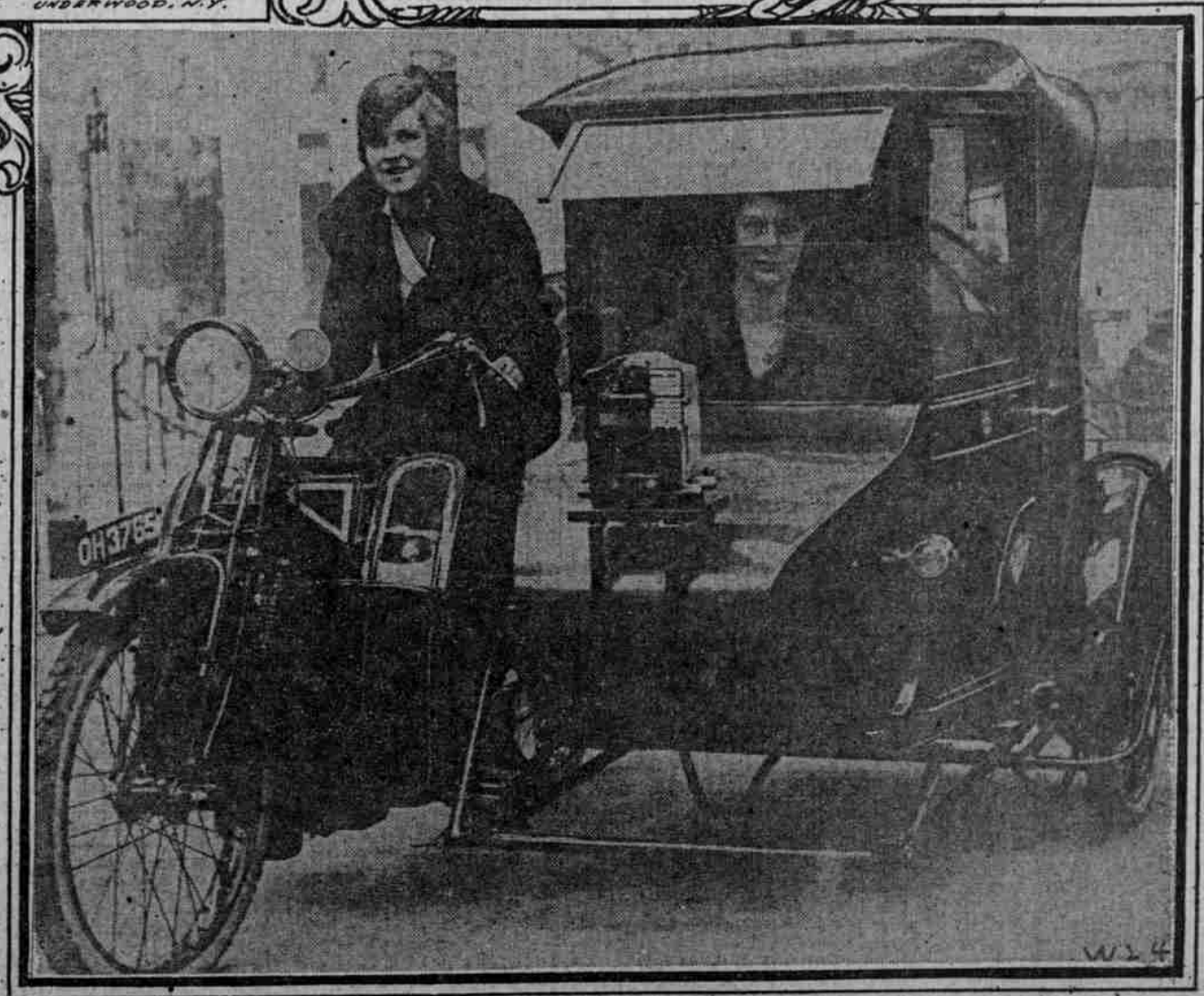
Motorcycle Taxi Popular In London.