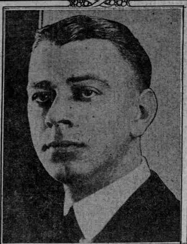
Youngest Congressman Ever Elected.

Motorcycles with side-cars are becoming popular in London as taxicabs, it is reported. Speed and low cost of operation make them popular. In some instances girls operate them.