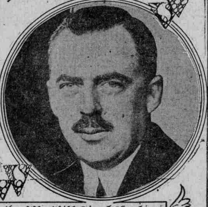
Man Who Will Direct Harding Inaugural.