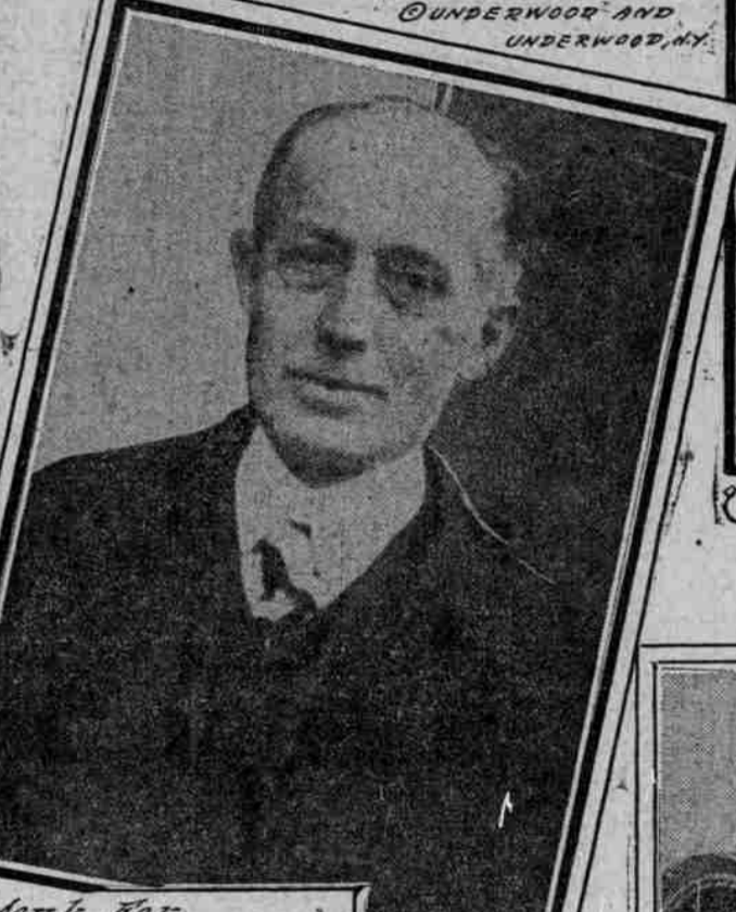
Monk for 20 Years Weds.