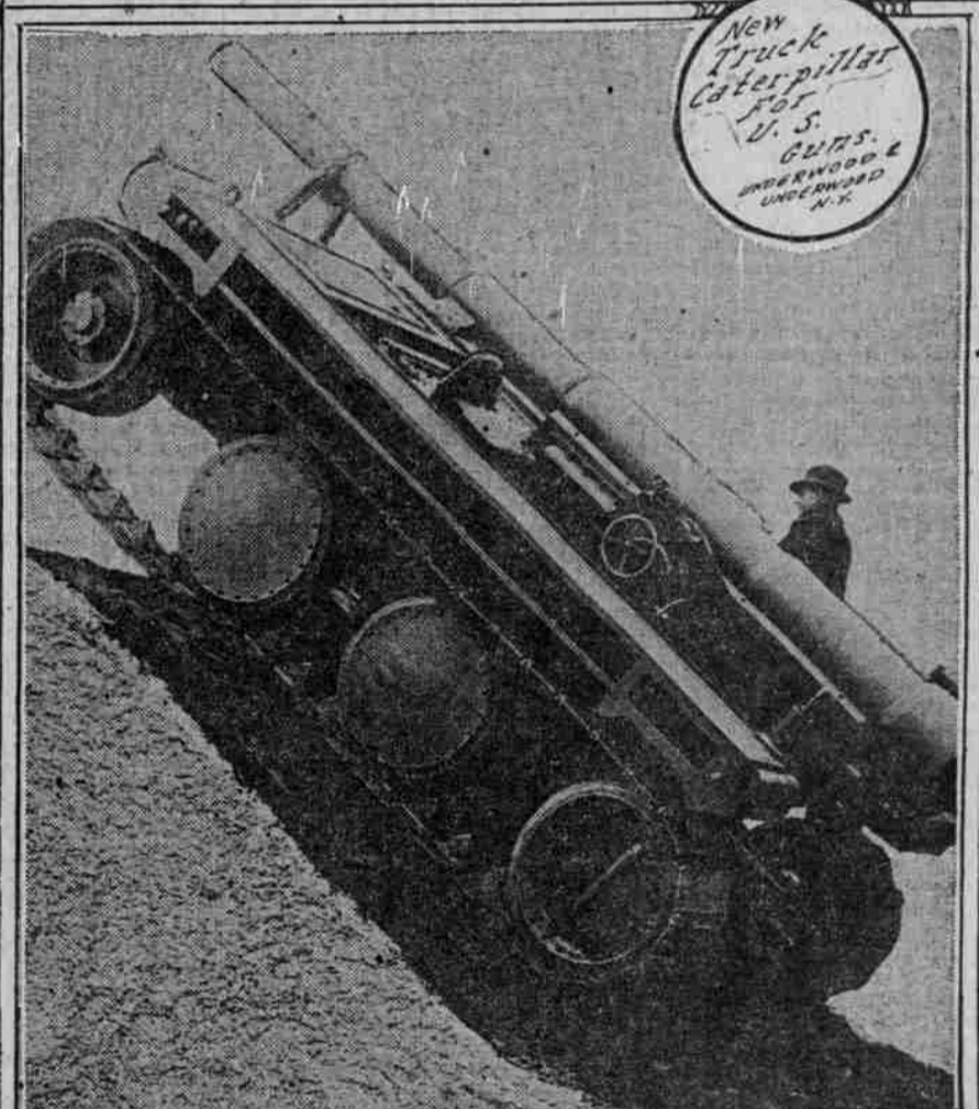
New Truck Caterpillar For U. S. Army.