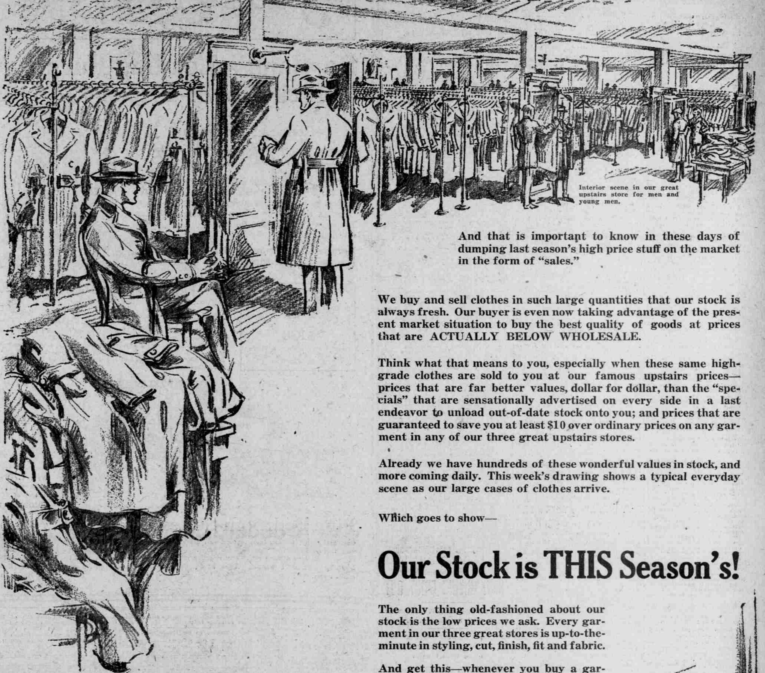
Interior scene in our great upstairs store for men and young men.

And that is important to know in these days of dumping last season's high price stuff on the market in the form of "sales."