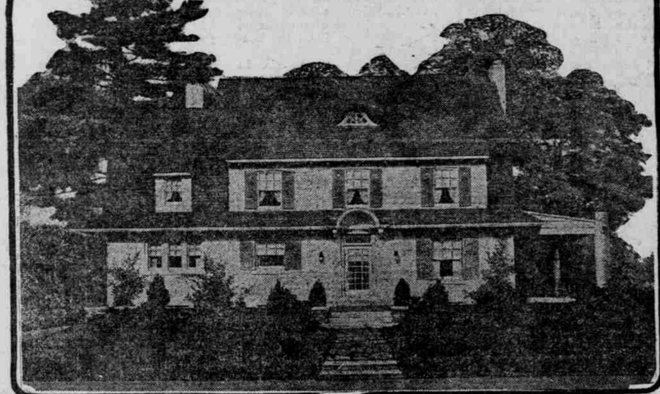
A House Which Seems to Have Grown Out of the Ground.