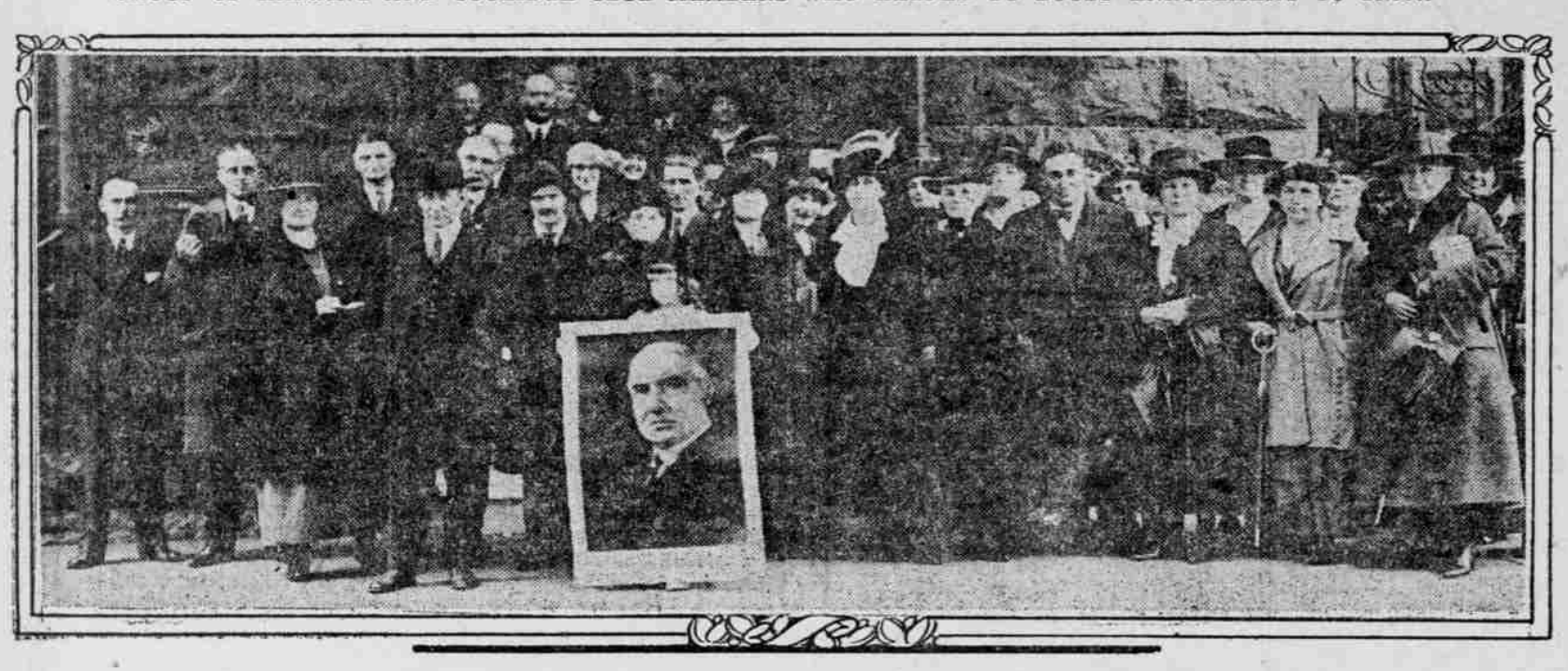
REPUBLICAN WORKERS LEAVING CLUB HEADQUARTERS AFTER NOON CONFERENCE.

President Needs Partisan Support. Whether you are republicans or whether you are democrats, it is for your best interests that the senate of the United States and the president be in harmony. Good results cannot be produced from discord. Constructive policies cannot be carried forward with fighting elements in control. No same business man would put two superintendents at the head of his plant, with practically the same powers, enemies of each other and each