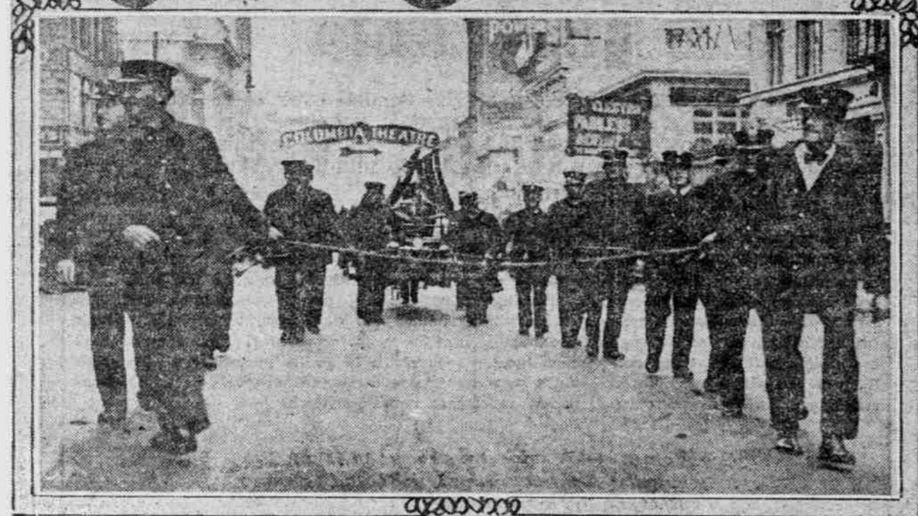
Upper left—"Convicts" who know that arson doesn't pay. Left—Ancient Chinese fire engine used in the early centuries. Lower—Fire-fighters hauling steamer of 1861 vintage through streets.