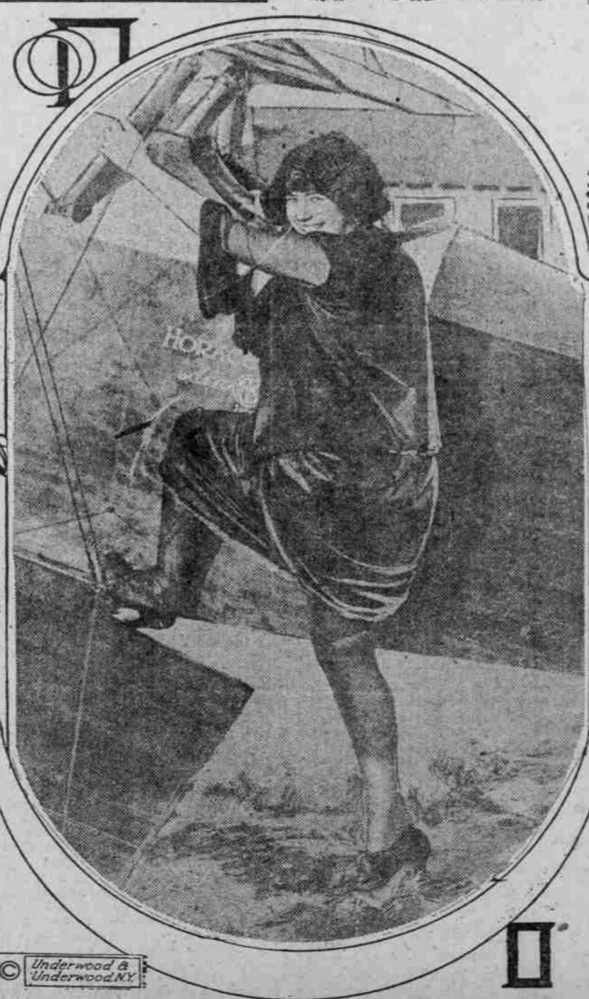
"Own Your Own Plane" Made Practical by Miniature Sport Plane.