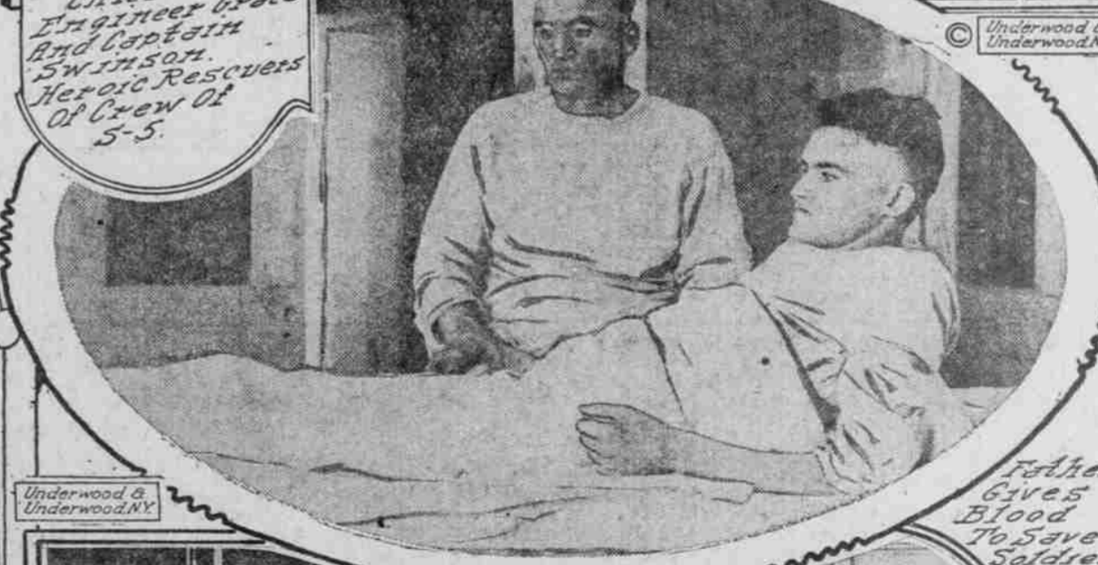
Father Gives Blood To Save Soldier Son.