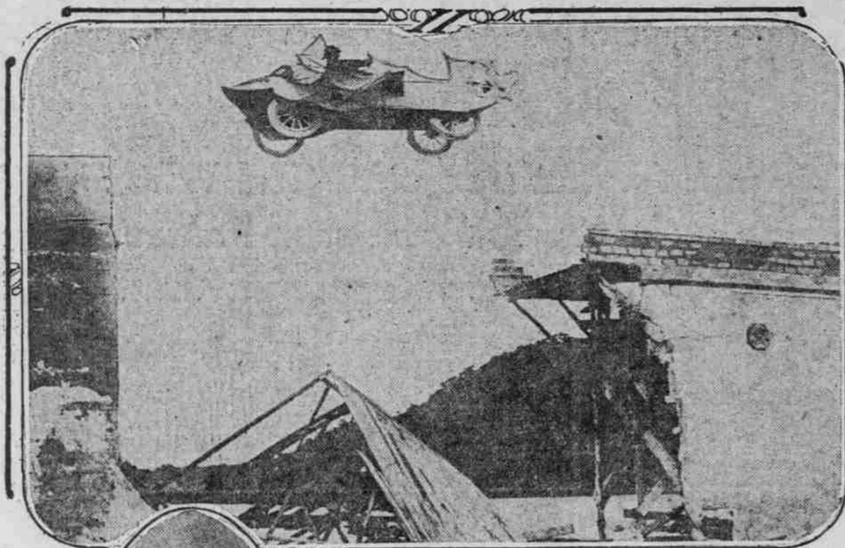
Remarkable Auto Jump Gives Thrill