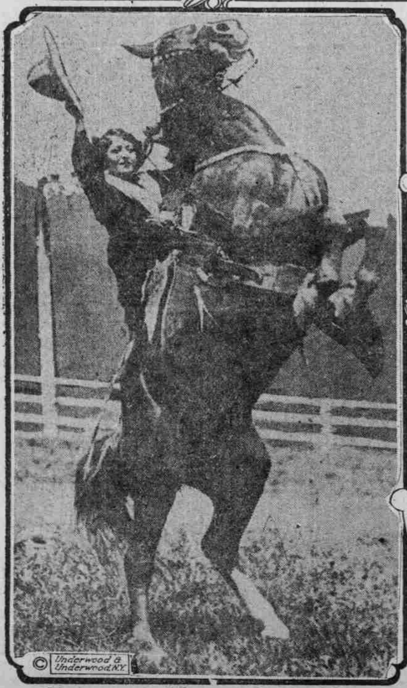
Champion Women Roper On Her Horse.