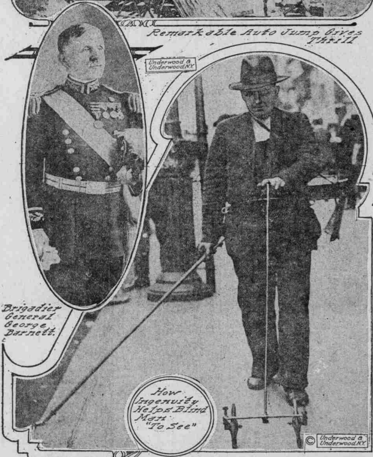
Brigadier General George Barnett.