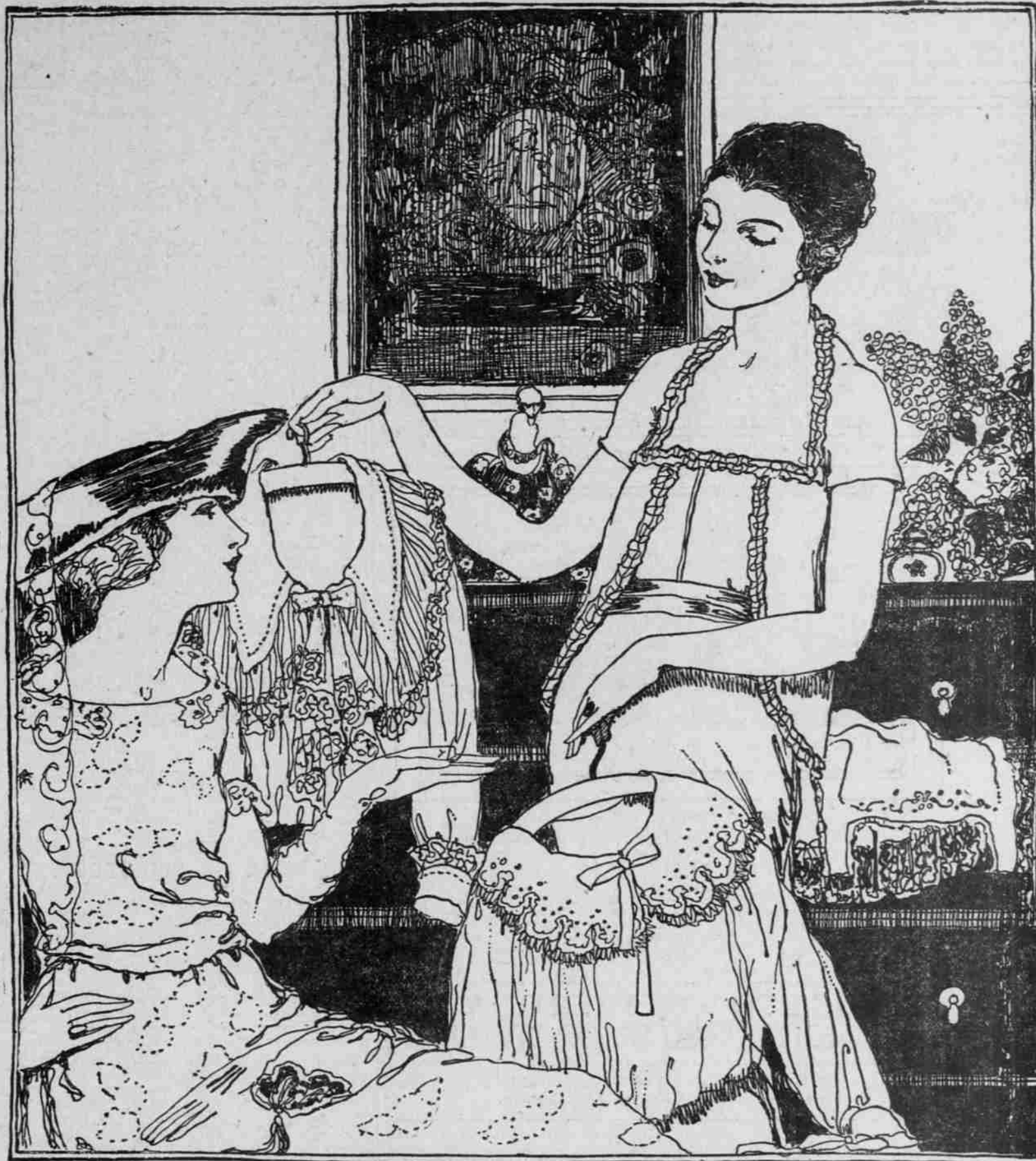
The organdy frock need not pull apart, nor the sweet net blouse lose its freshness. You can keep them new with Lux

Your nice cotton and linen things cannot stand scrubbing any more than your georgettes and chiffons.