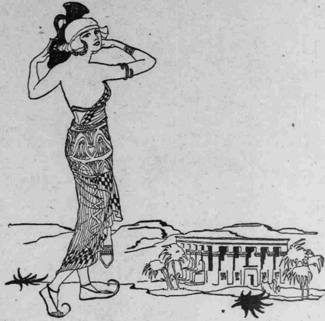
Palm and Olive oils were discovered in ancient Egypt 3000 years ago