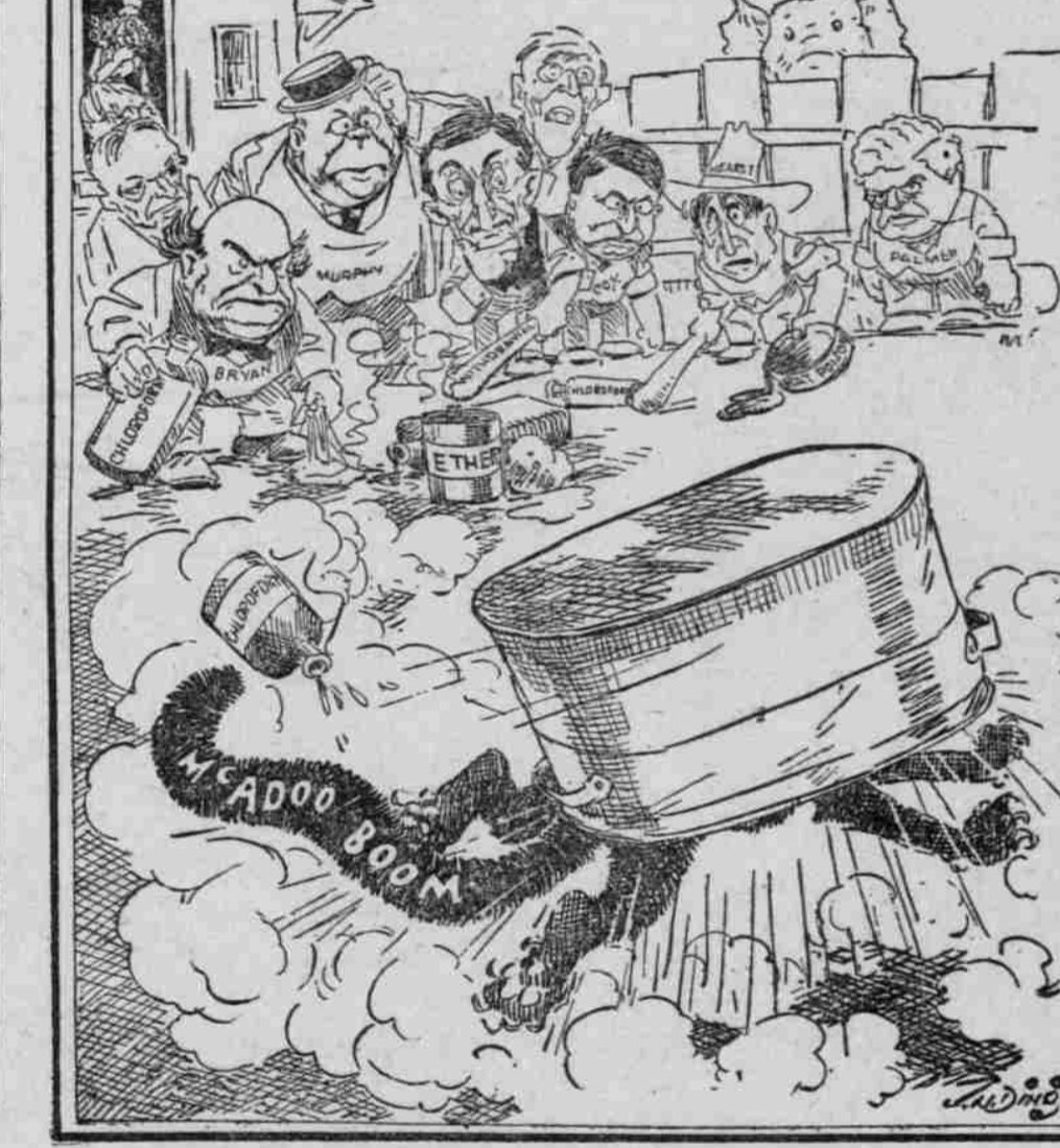
IT TOOK THE WHOLE FAMILY TO CHLOR-OFORM IT.