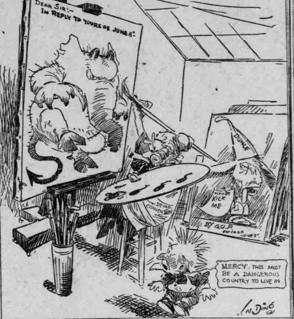
IF YOU LET THEM TELL IT.