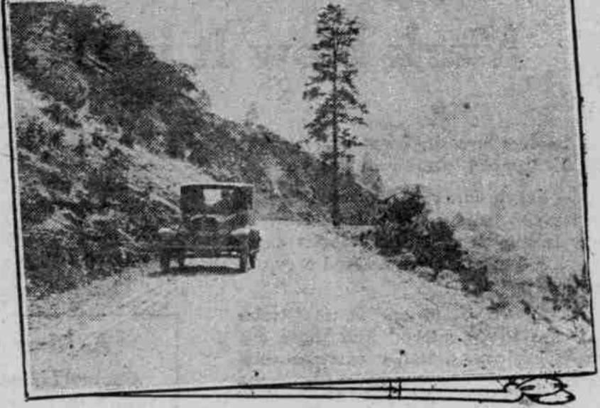
Between Sisson, which is almost under Mount Shasta, and Shasta Springs traverses the Pacific highway for much of the distance a beautiful wooded country of great fir trees.

The pavers have been held back by wet weather, so are about a month behind in paving the Columbia river highway from Cascade Locks to Hood River.