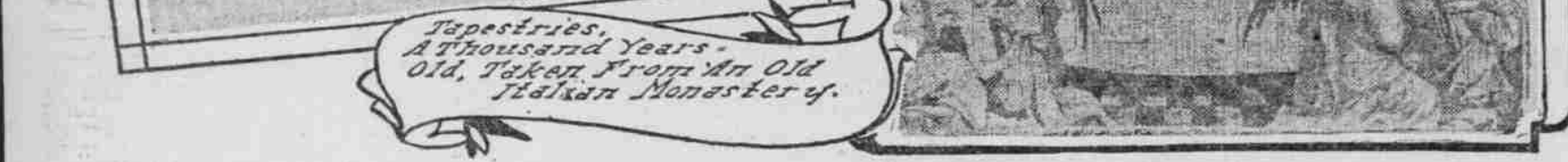
Peperies, A Thousand Years Old, Taken From An Old Italian Master's

He used to take trips east all the time. He called them business trips. He called them business trips because he had a little business. He had a little business in New York. He had a little business in New York. He had a little business in New York.