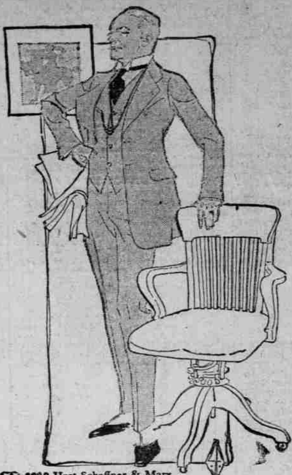
Copyright 1920 Hart Schaffner & Marx

S. & H. green stamps for cash. Holman Fuel Co. Main 353, 560-21. —Adv.