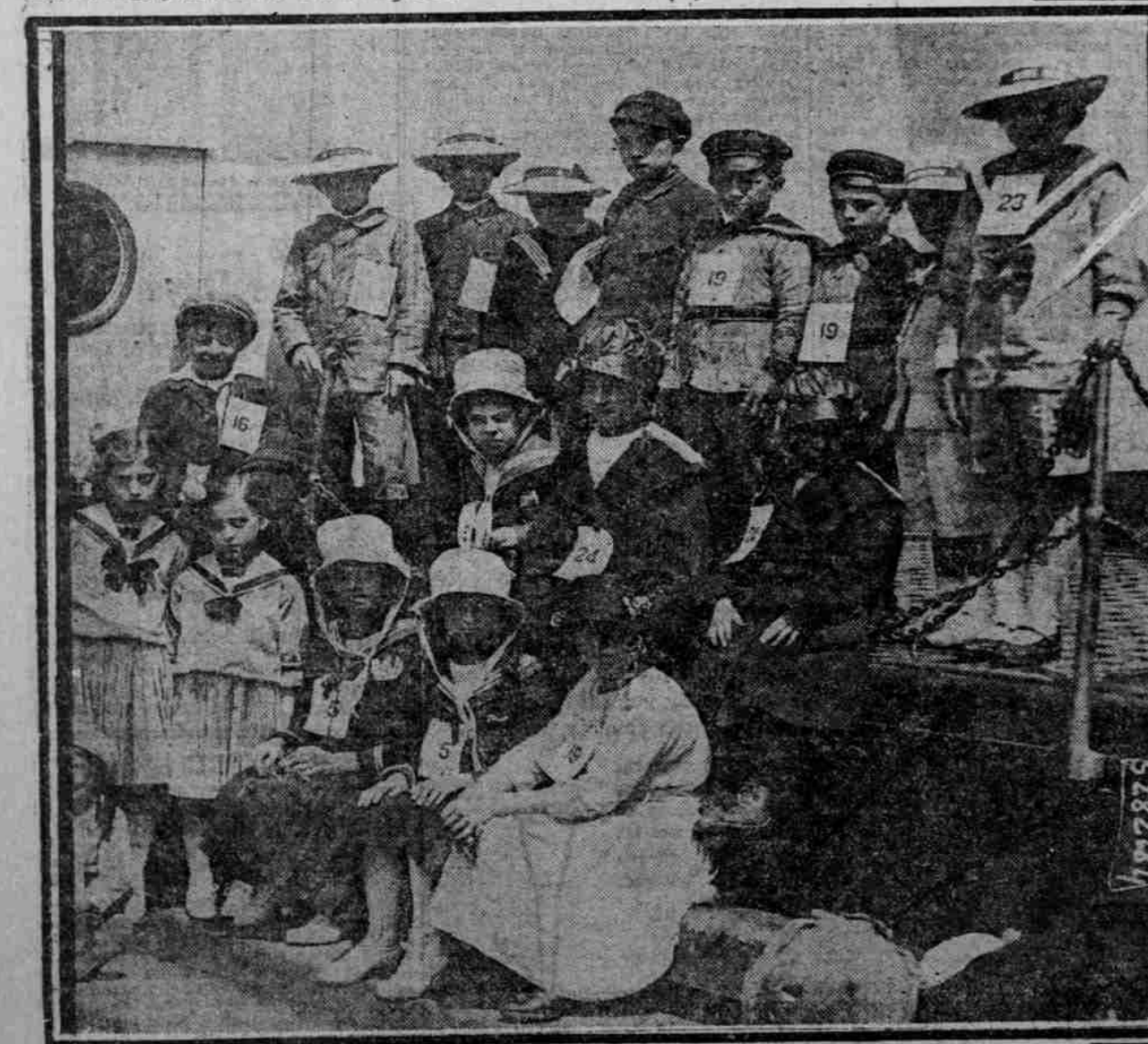
Youthful Immigrants On S.S. Rotterdam.