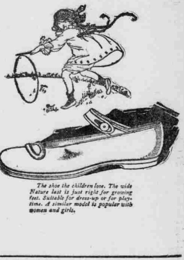
The shoe the children love. The wide Nature last is just right for growing feet. Suitable for dress-up or for play-time. A similar model is popular with women and girls.