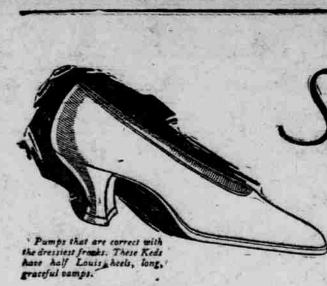
Pumps that are correct with the dressiest frocks. These Keds have half Louis heels, long, graceful pumps.

It is sometimes useful to remember in using this method that very juicy fruit canned without sugar in double cased pies, that these very juicy pies can be more satisfactorily dealt with by the same method that is used for lemon pies on the principle that it is better to have the juice in the pie than on the bottom of the oven. You bake a pie shell (on the inverted pie plate) just as for lemon