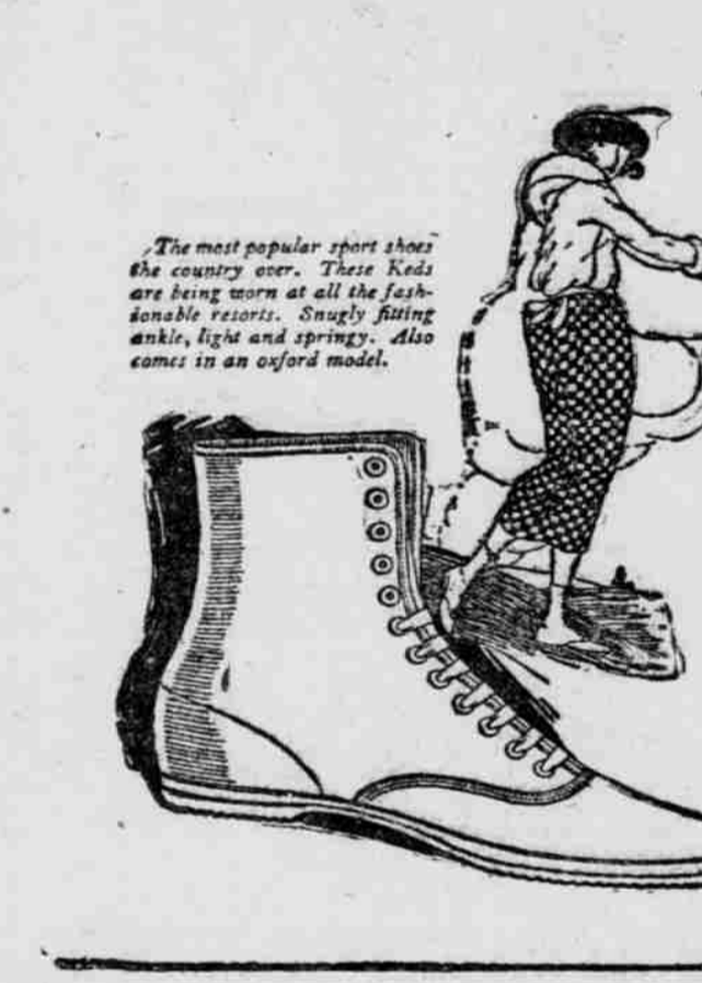
The most popular sport shoe the country over. These Keds are being worn at all the fashionable resorts. Snugly fitting, ankle, light and springy, also comes in an oxford model.