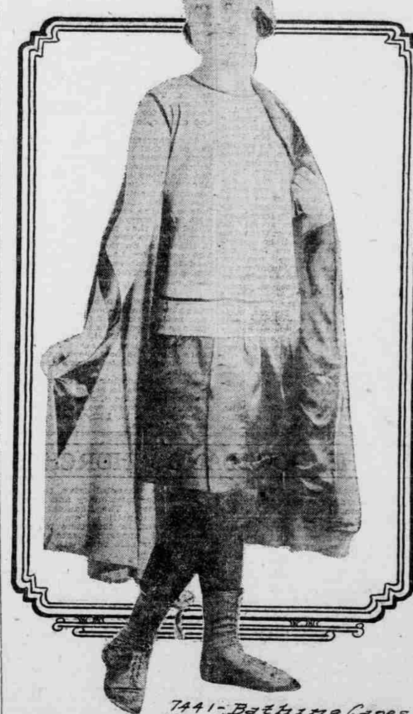
7441—Bathing Capes Now Indispensable.

Ming Toy Suit Picturesque. There is a delightful little bathing dress called the Ming Toy—after the little Chinese girl in a popular play of the winter. This bathing suit has a straight, untripped tunic of jade colored satin over very full black