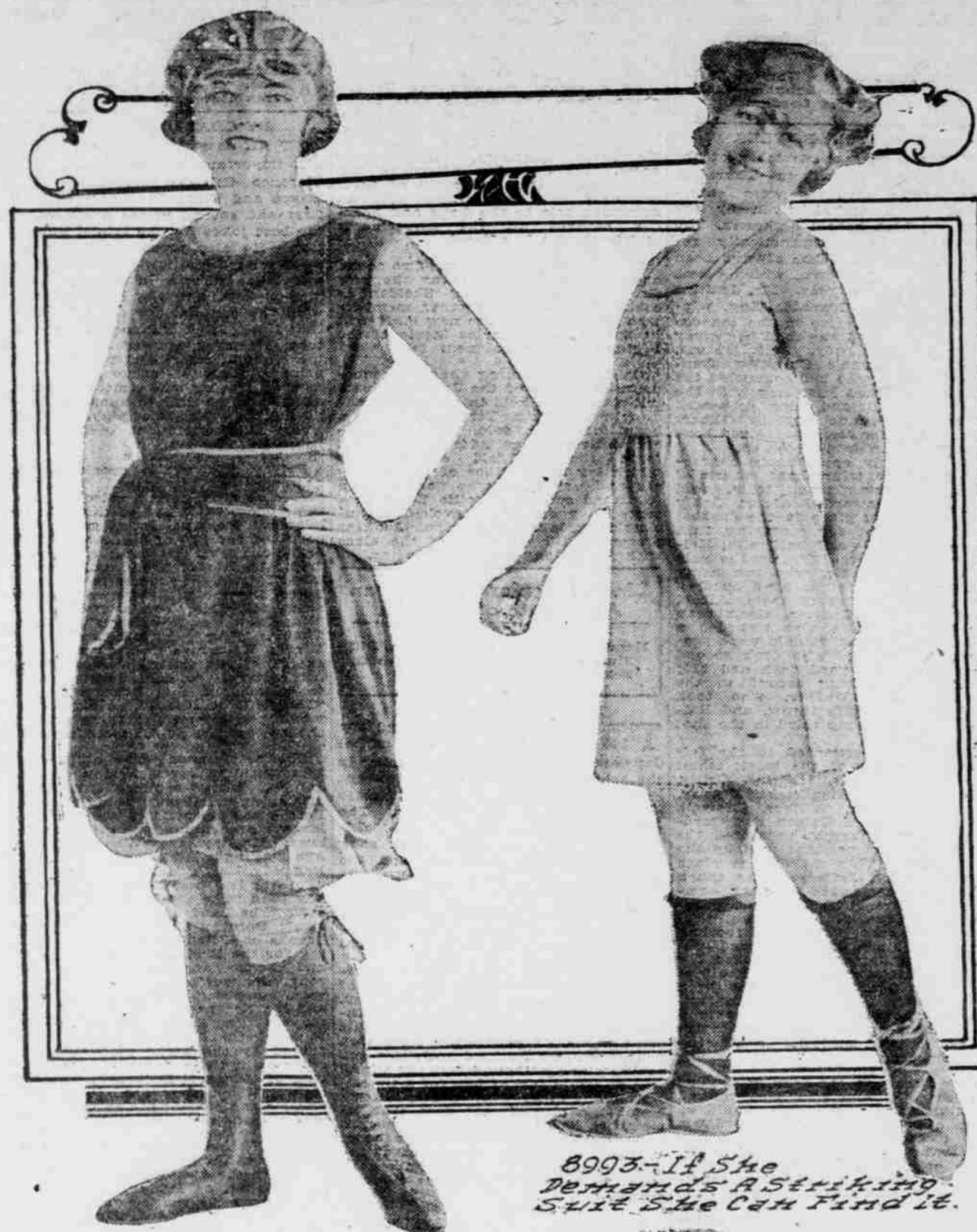
7490—Good Taste and Modern Style Combine Here.

New Styles Are Pleasing to Good Taste With Low Waistline Effects Apparently Liked Best—Bloomers Now Are Important Style Detail of Suit.