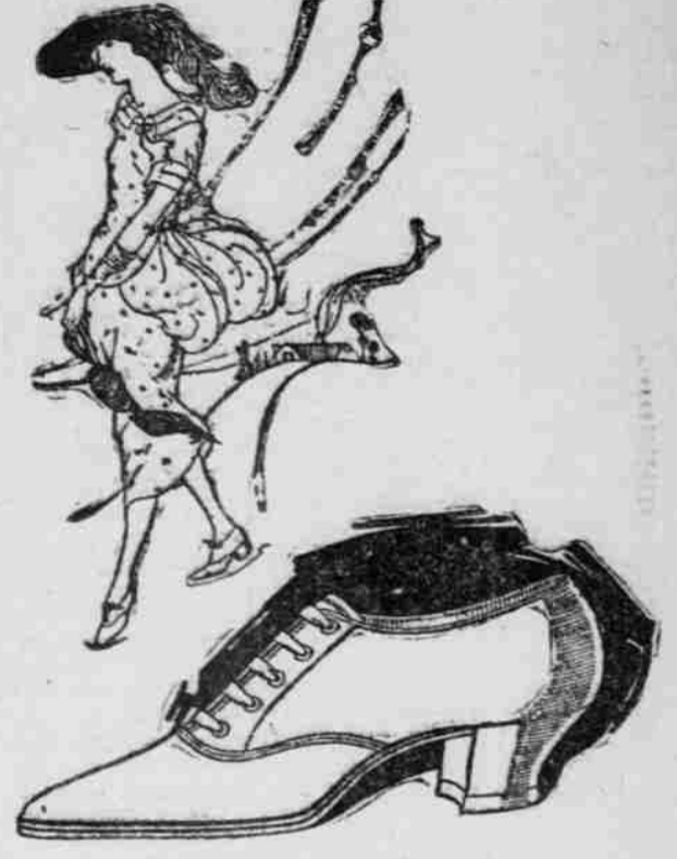
These Keds oxfords are just right for street shoes—slender lines, military heel, of fine even canvas.

Men's and women's $1.50-$7.00 Children's $1.15-$4.50