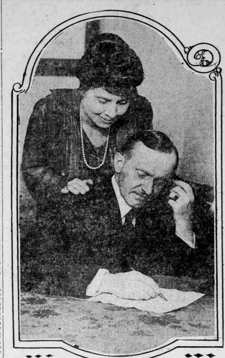
WARREN G. HARDING AND MRS. HARDING.