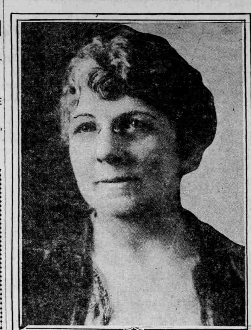
MRS. WARREN G. HARDING.

When he was 19 years old, shortly after he had completed his course at the Ohio Central college, the family moved to Marion, O., then a growing town of about 4000 inhabitants.