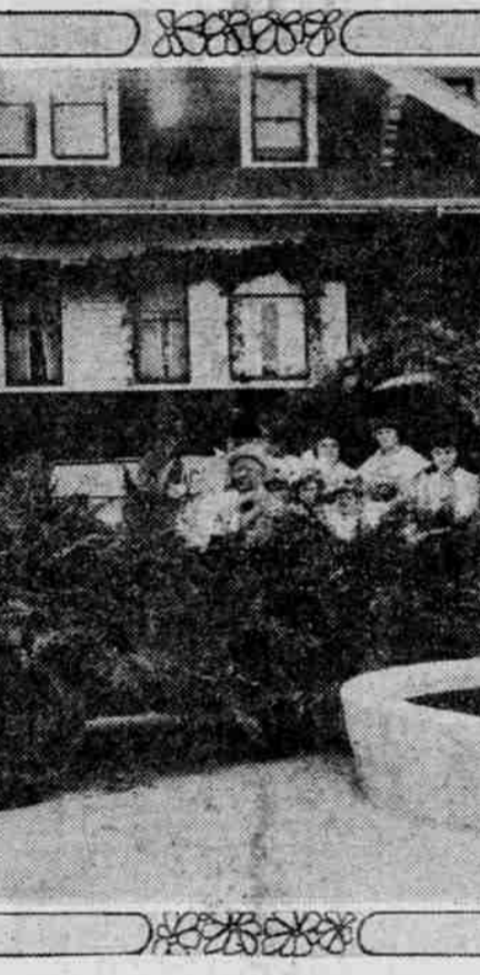
QUEEN DOROTHY AND ATTENDANTS IN CAR.

increase was smaller than either of the two decades preceding 1910. The latest estimate of the population of the city and county of London, made in 1917, was 4,924,901, a decrease from the official census of 1911, which showed a population of 4,221,685.