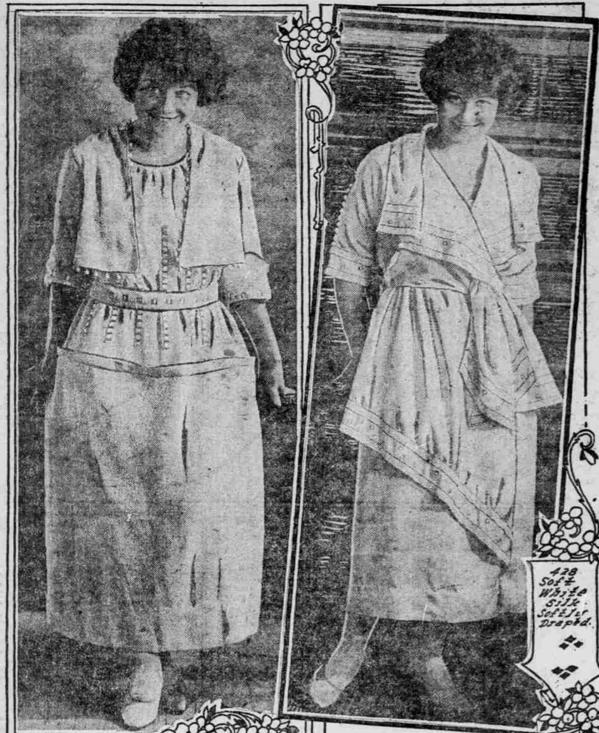
421—These Little Boloeros Are Smart

New Sport Sailor of Black Milan Has Brim Narrow at Back and Scoops Down in Front—Upturned Tuck Set at Hipline Breaks Plain Gathered Skirt.