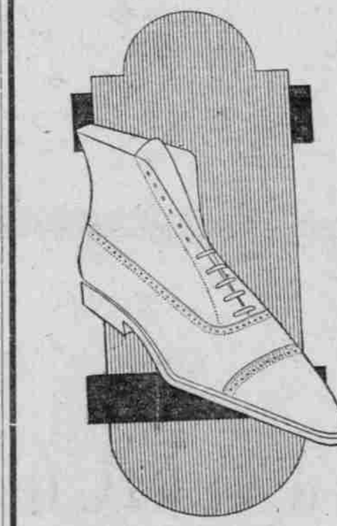
M-5544—Nut brown calf English lace, with fawn nubuck top. Regular price $12.00.