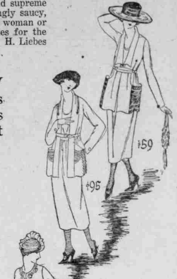
Navy Beige Checks Two-Color Effects

Representing the production of America's finest and most renowned makers of suits, in a comprehensive showing of the season's choicest modes. Individuality is secured in these suits, as in many cases there is only one of a kind.