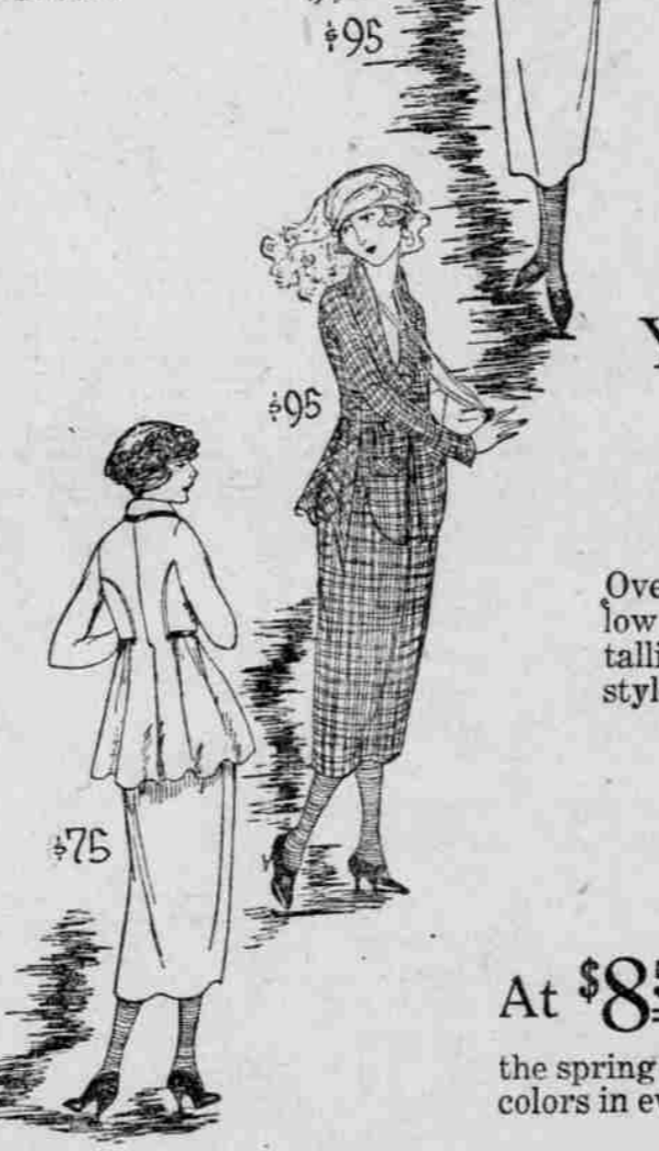
Ten Models Sketched