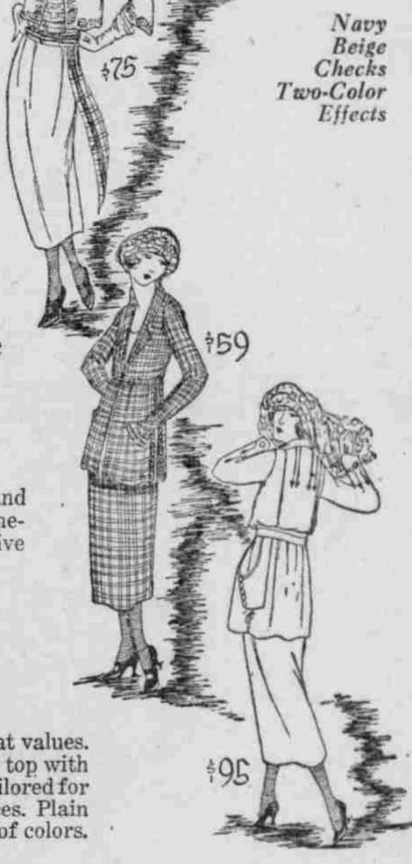
Many Models Not Shown Here

At $8.50 The utmost in present-time petticoat values. In great variety. All jersey, jersey top with taffeta flounces, all satin in plain tailored for the spring silhouettes, also styles with many flounces. Plain colors in every shade and attractive combinations of colors.