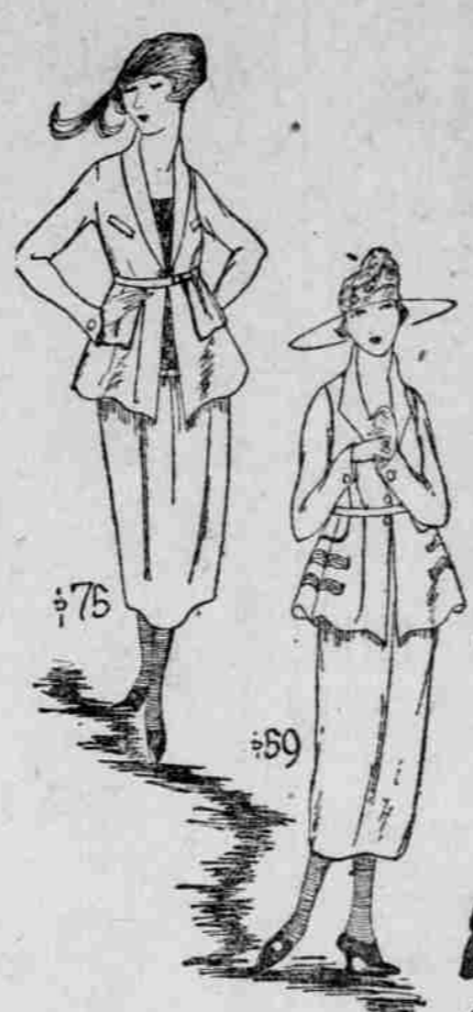
Serge Tricotine Poiret Twill Gloveskin Checks