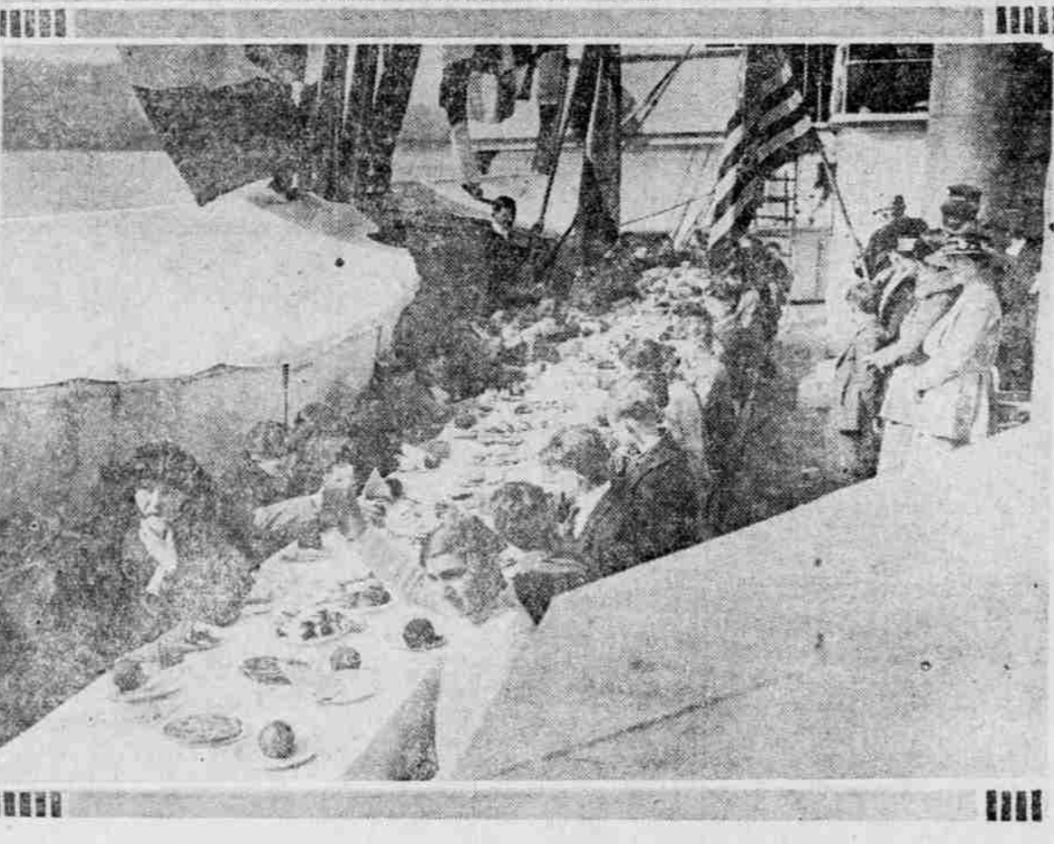
ABOVE—STEAMER BEARPORT LOADING FLOUR IN PORTLAND HARBOR FOR RELIEF OF STARVING IN ARMENIA. BELOW—LUNCHEON SPREAD ON BEARPORT'S BRIDGE DECK.