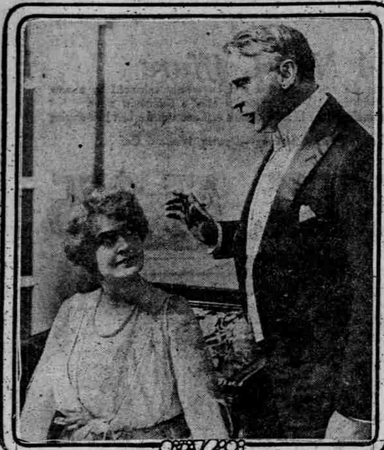
Scene from "Civilian Clothes"

Oliver Morosco Picks Winner in "Mamma's Affairs," Produced at Little Theater—Grace George Has Daring Vehicle, "The Ruined Lady."