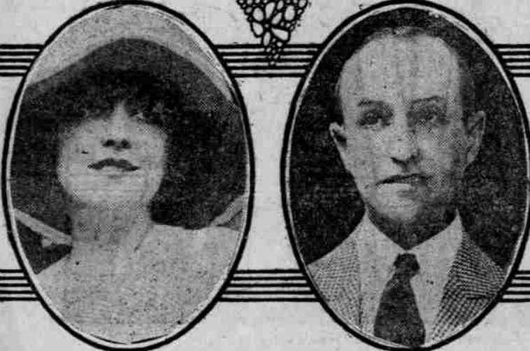
Grace Valentine Soon to be Seen in New York in a New Play.