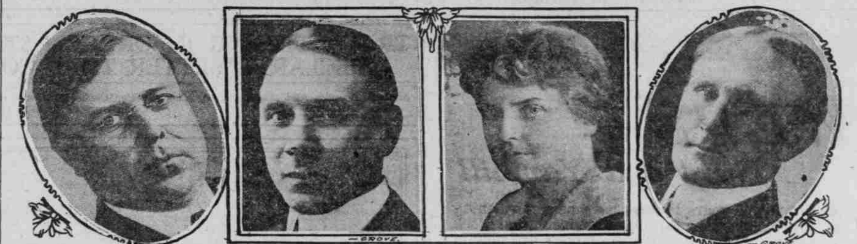
Portland church members receiving local and state honors from their fellow church men and women.