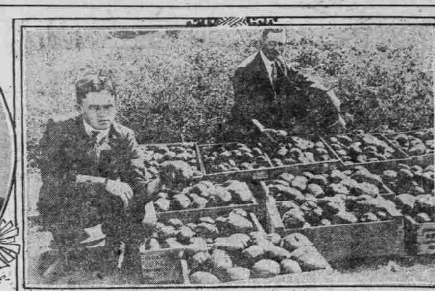
Diener Tomatoes Every One A Meal In Its Self. Some Weighing Four Pounds.

are picked, these flowers when cut and put in water will last for two or three weeks and even new flowers will bloom while they are in the